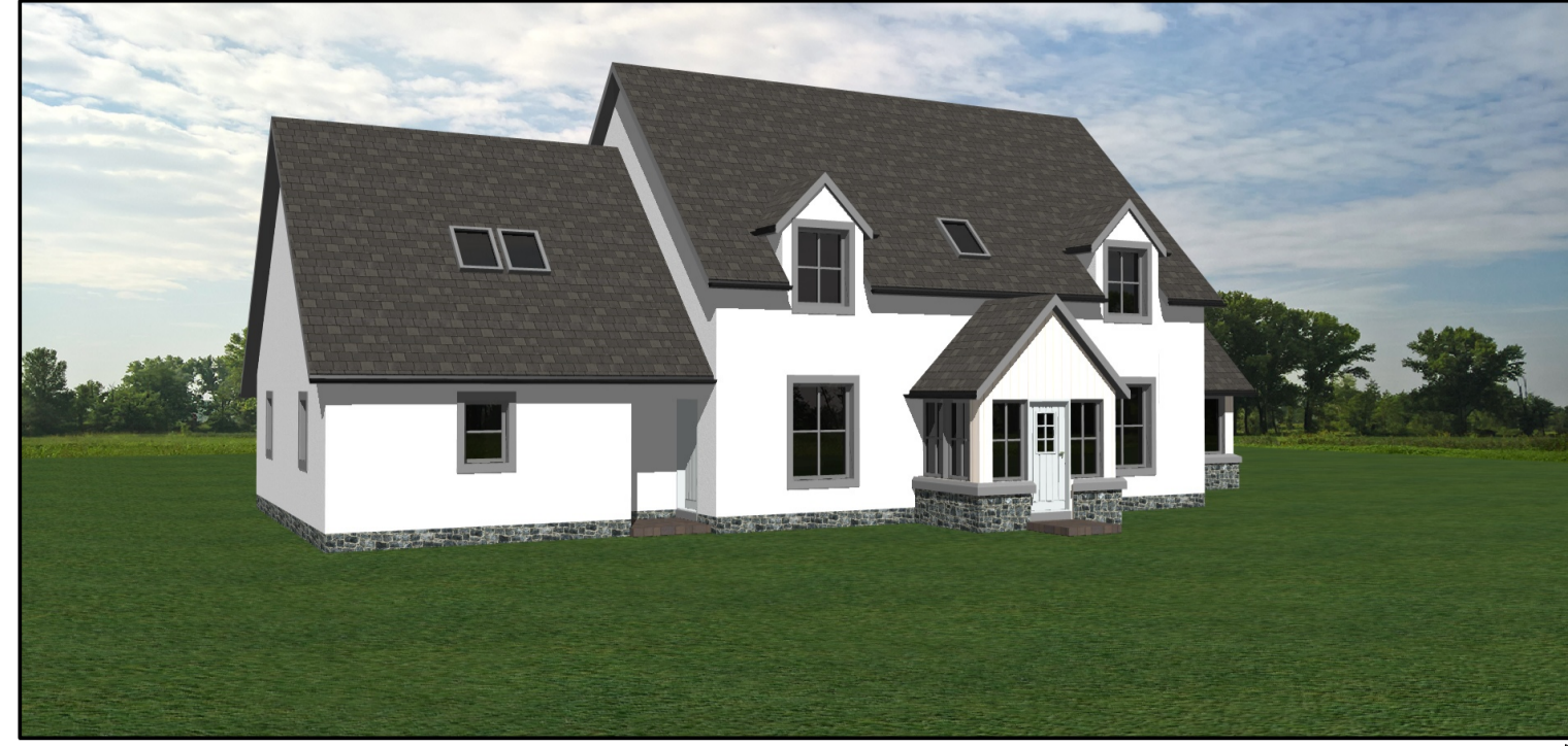
VIEW 1... NTS