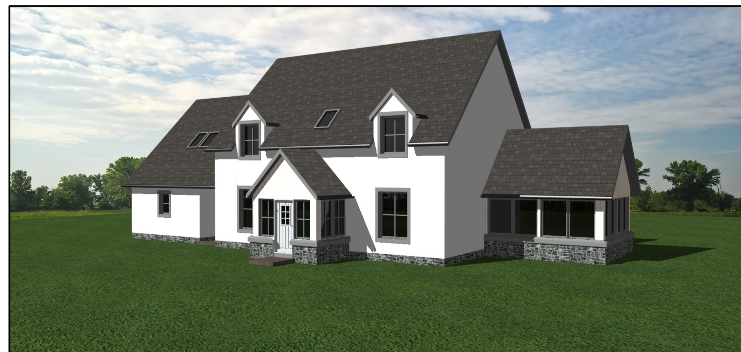
VIEW 2... NTS