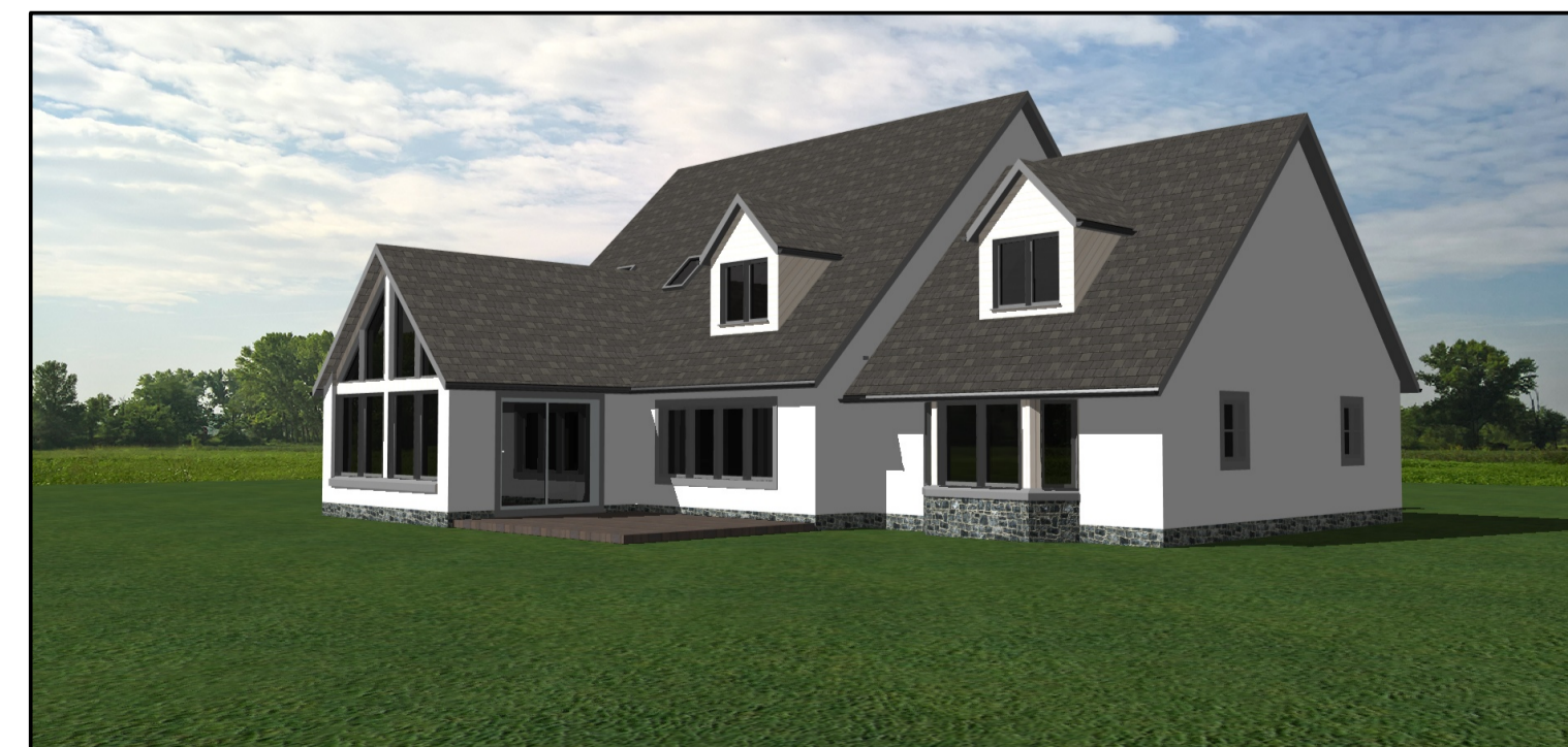
VIEW 4... NTS

Rev. D - Stove removed JB 23/04/24 Rev. C - Window bands amended JB 07/02/24 Rev. B - Master bedroom & boot room amended JB 05/02/24 Rev. A - Master bedroom & boot room amended JB 30/01/24 REVISION INT DATE