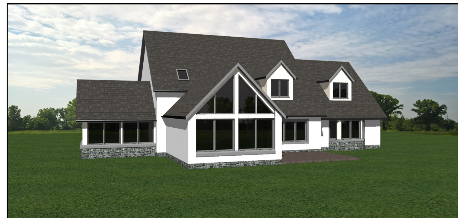
VIEW 3... NTS