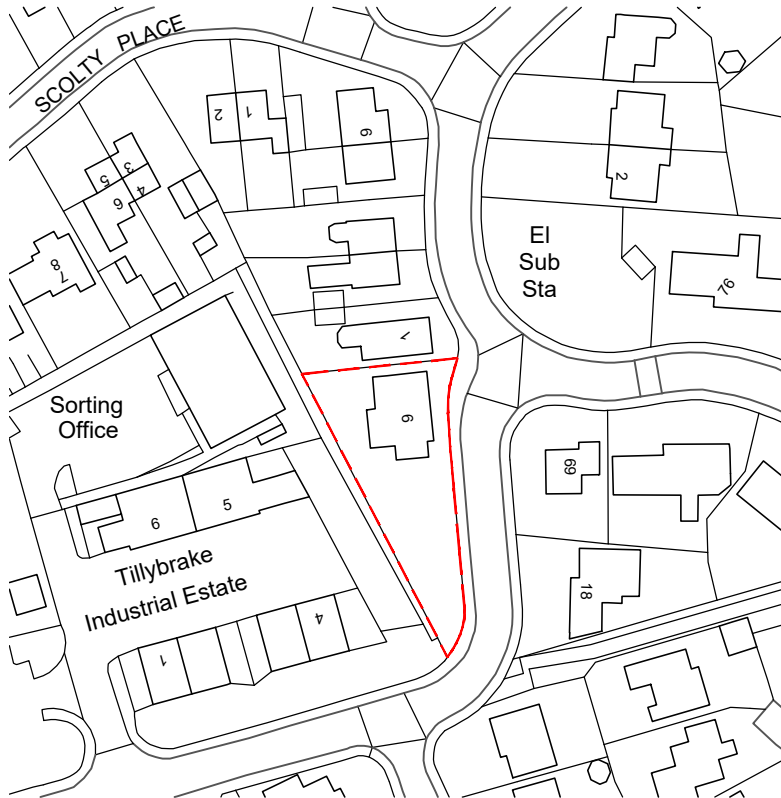
LOCATION PLAN SCALE: 1:1250.