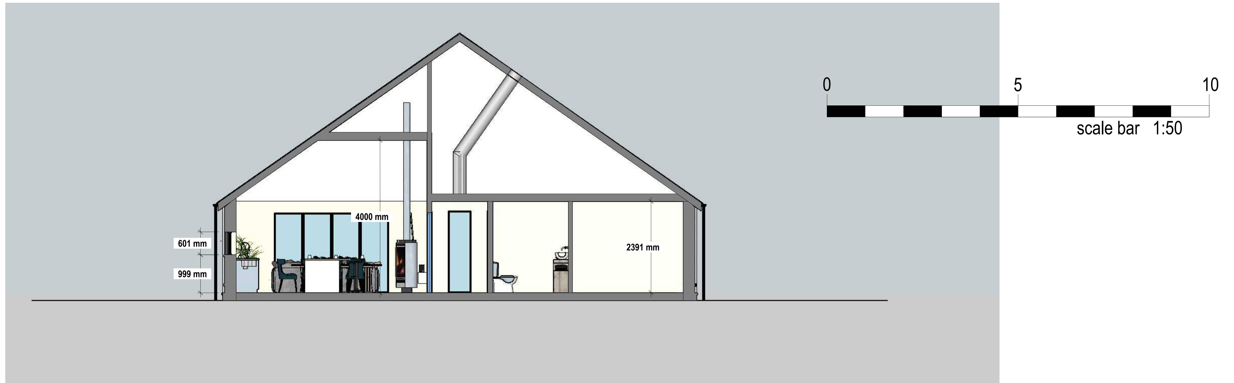
TYPICAL SECTION THRU LIVING AREA 1:50