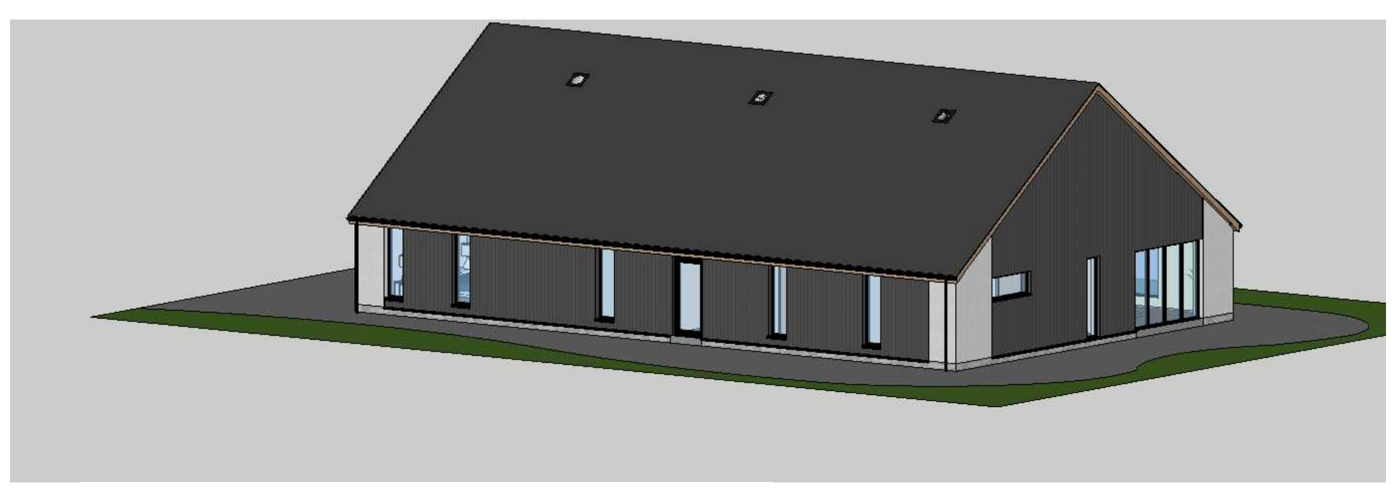
NORTH ISO VIEW 1:100