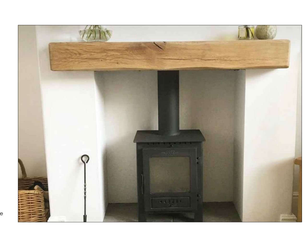
Indicative timber mantel

Bedroom -----_____ -----Existing fire surround and tile hearth to be removed (not ----original to building see photos) -----Lounge Pend No 43/45 Wood burning stove installed into recess, Woodwarm 5kW Fireview eco traditional, flue taken through existing chimney New slate hearth 300mm in front of stove and 150mm to each side. Timber mantel above