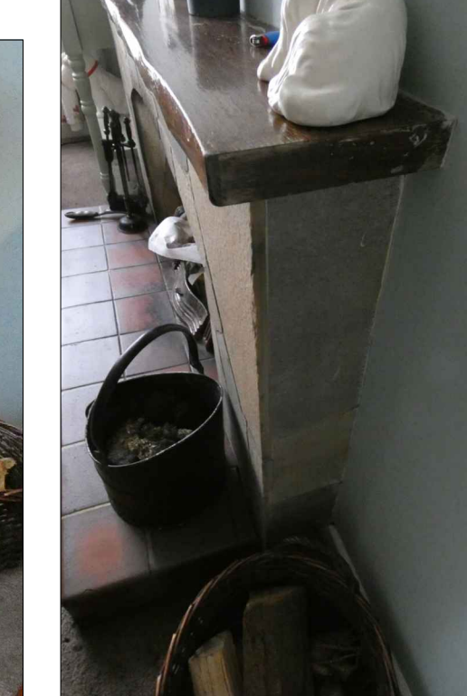
Photos of fire surround and hearth to be removed back to original opening