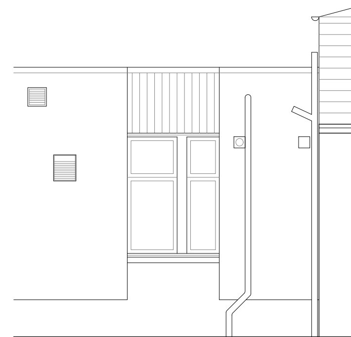
WEST ELEVATION 1:50