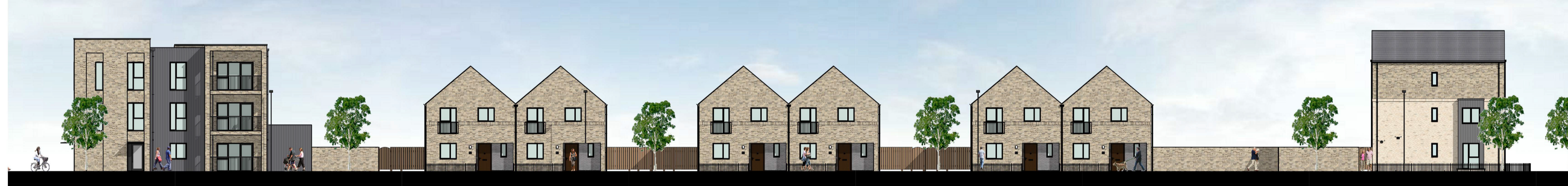
1_SW Site Elevation