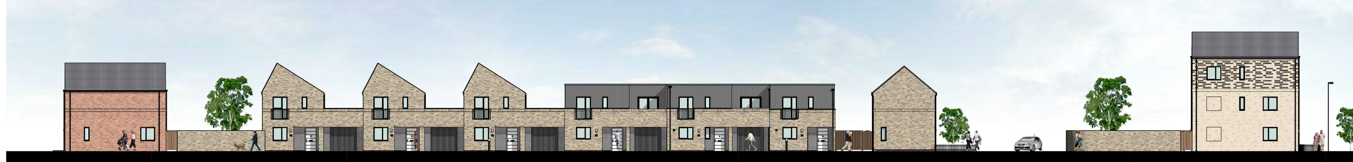
1_M SW Site Elevation