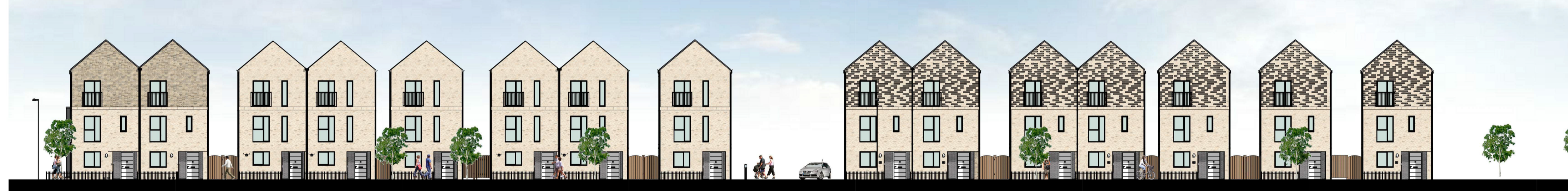
1_SE Site Elevation