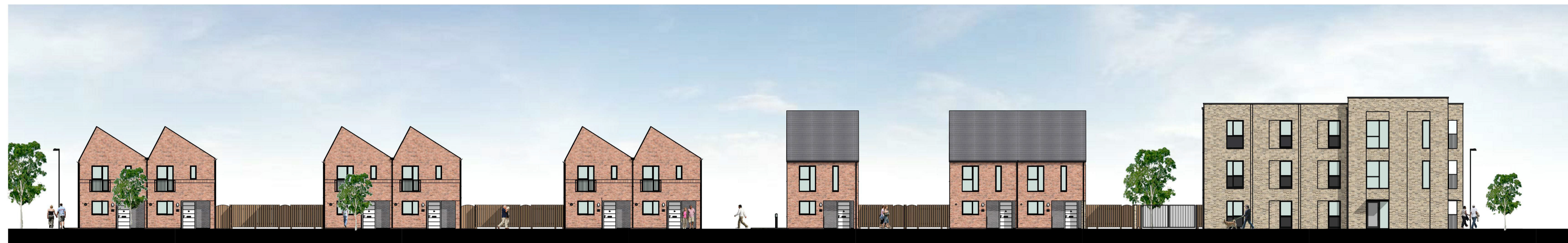
1_NW Site Elevation