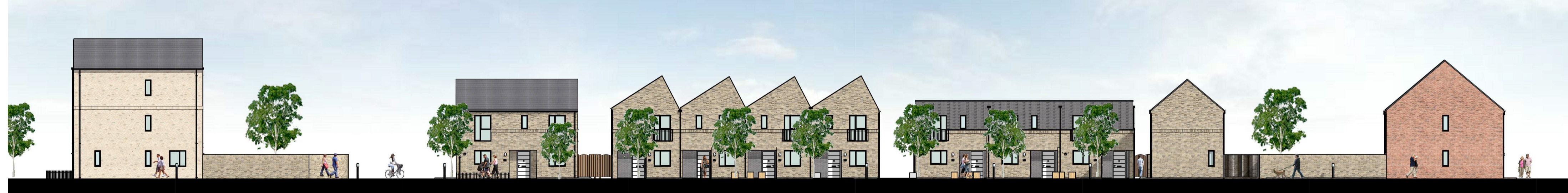
1_M NE Site Elevation