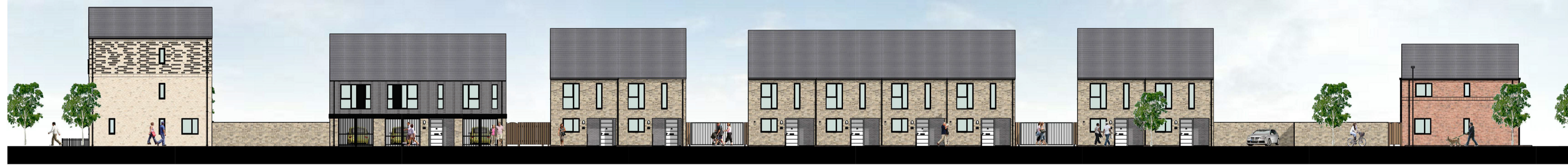
1_NE Site Elevation