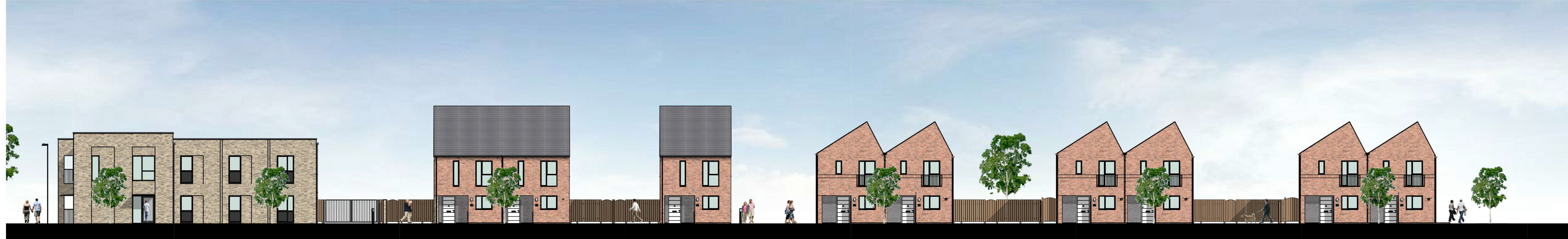
2_NW Site Elevation