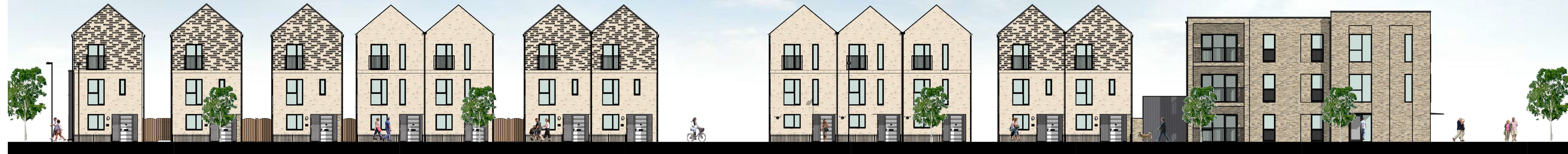
2_SE Site Elevation