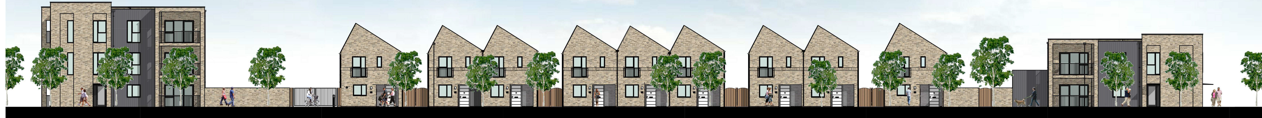
2_NE Site Elevation