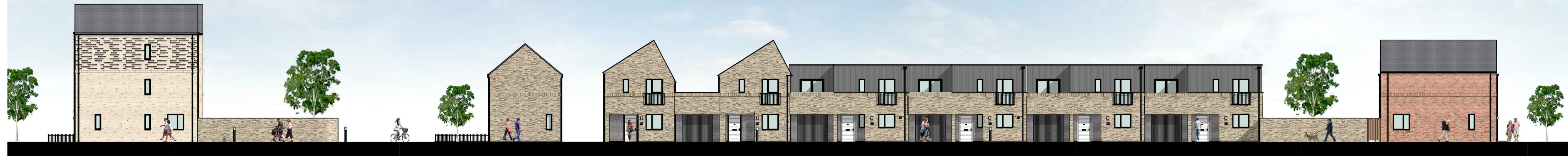
2_M NE Site Elevation