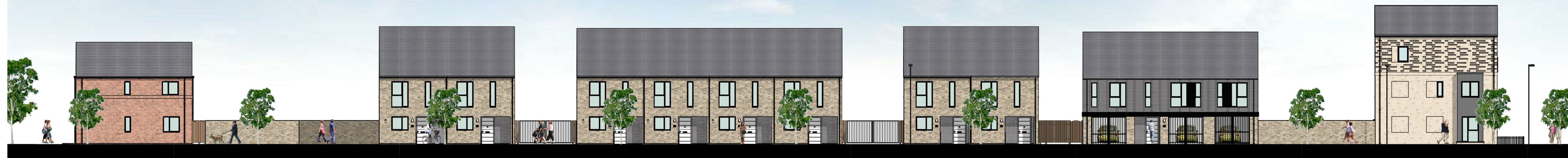
2_SW Site Elevation