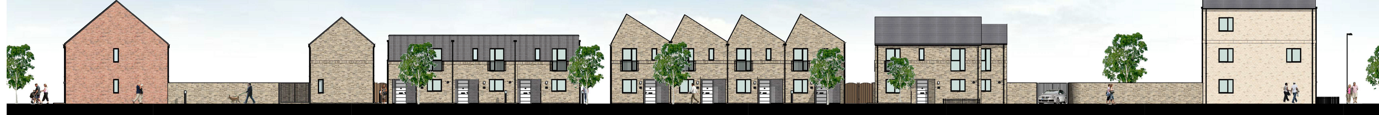
2_M SW Site Elevation