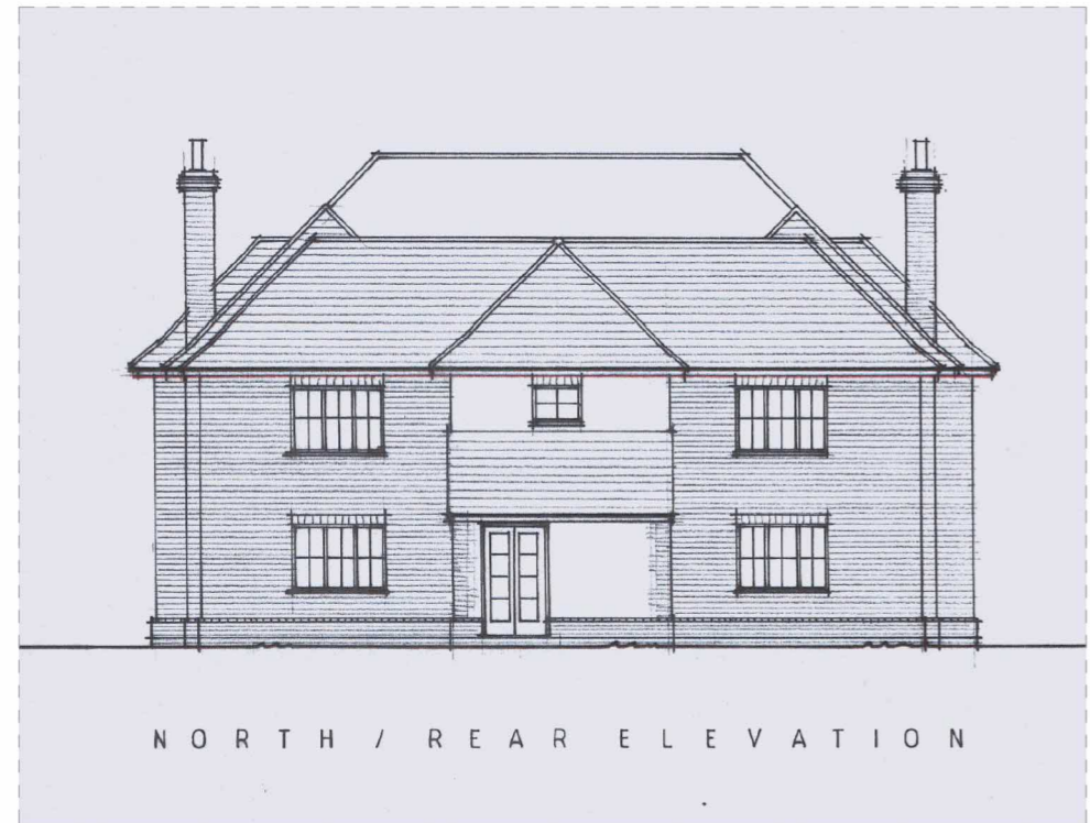
NORTH / REAR ELEVATION