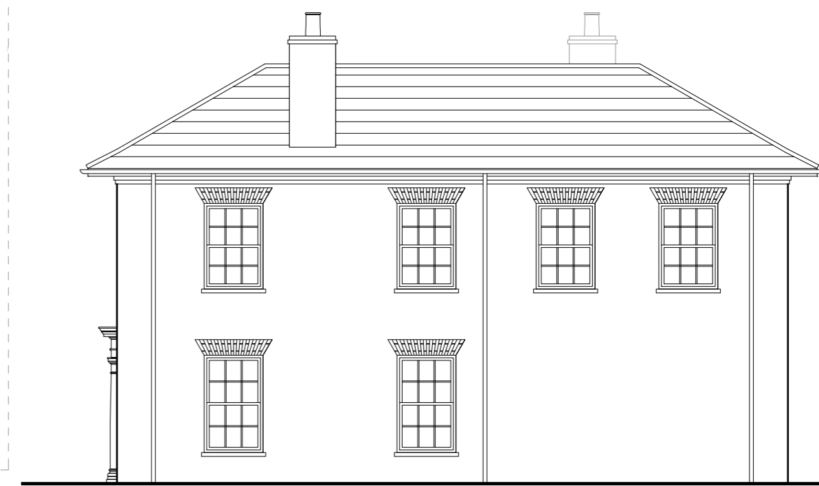
SIDE ELEVATION - East 1:100 Scale @A2 1:141 Scale @A3