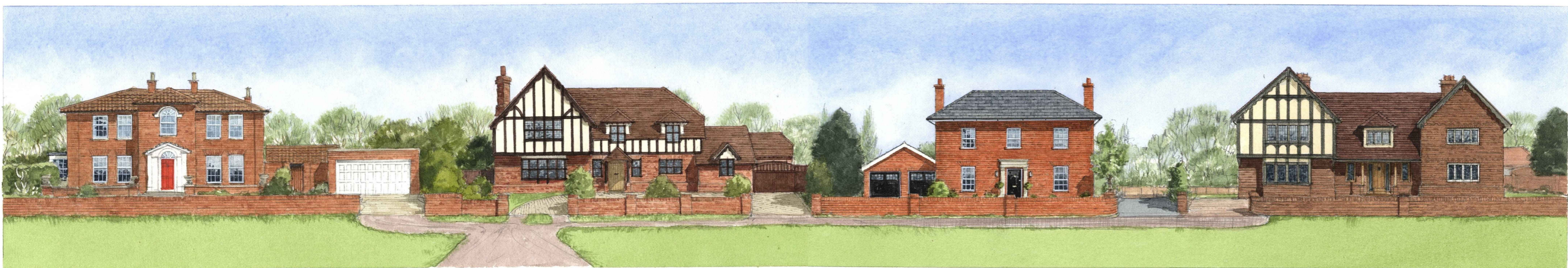
PROPOSED STREET SCENE 1:219 Scale @A2 1:296 Scale @A3