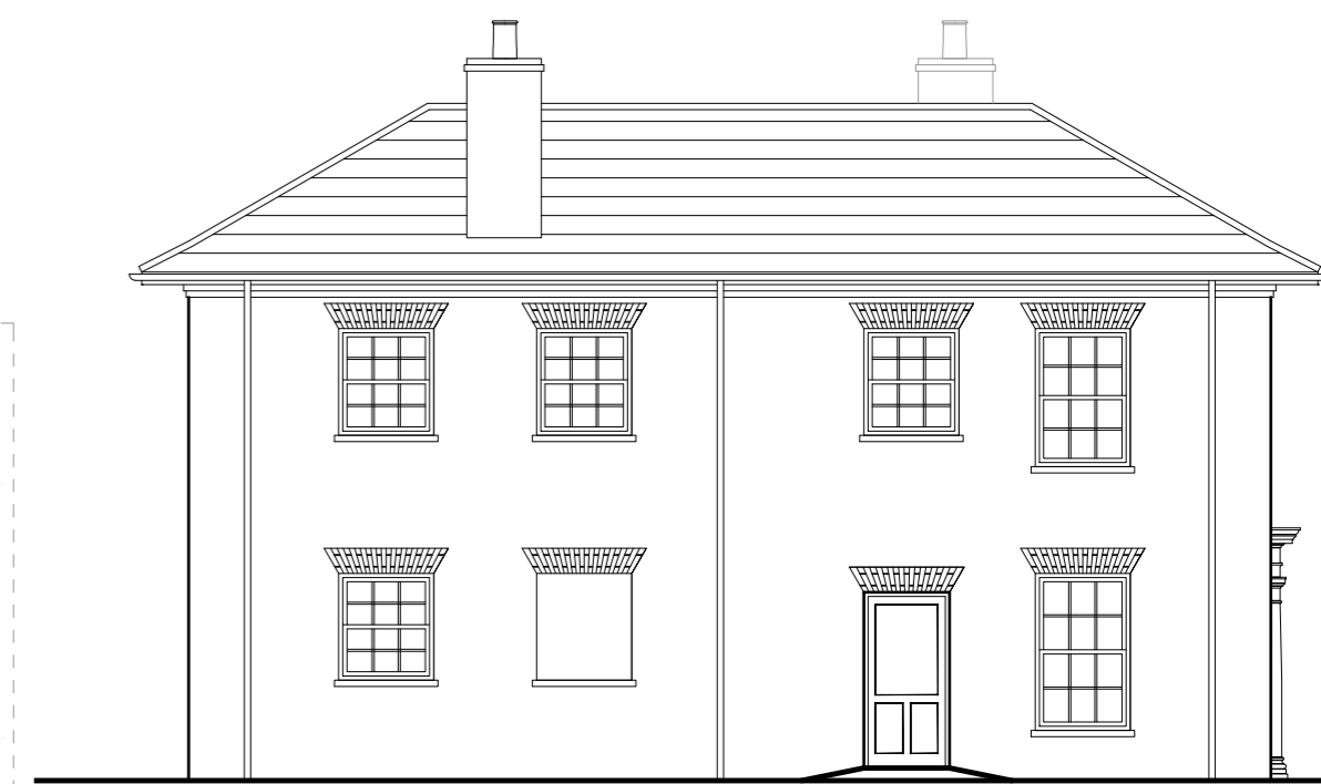
SIDE ELEVATION - West 1:100 Scale @A2 1:141 Scale @A3