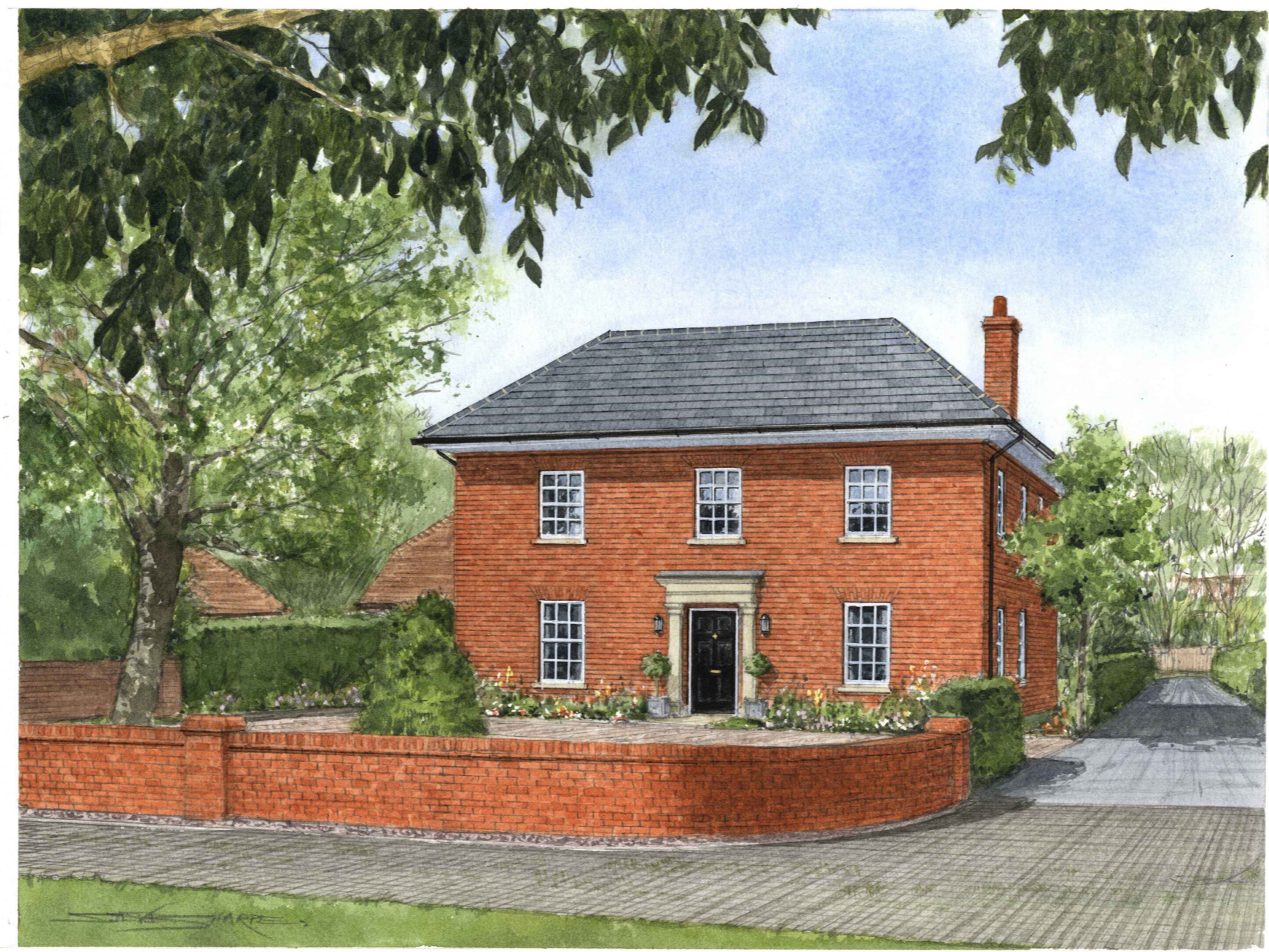
ARTIST IMPRESSION 1:129 Scale @A2 1:185 Scale @A3