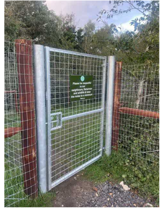
Example photo 3 (4ft wide gate and fencing)