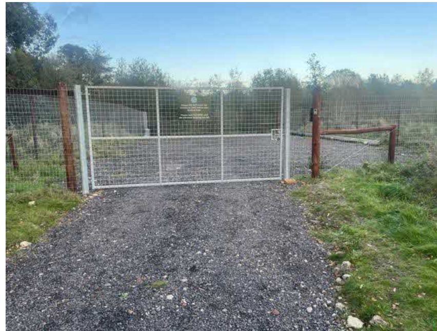
Example photo 2 (12ft wide gate and fencing)