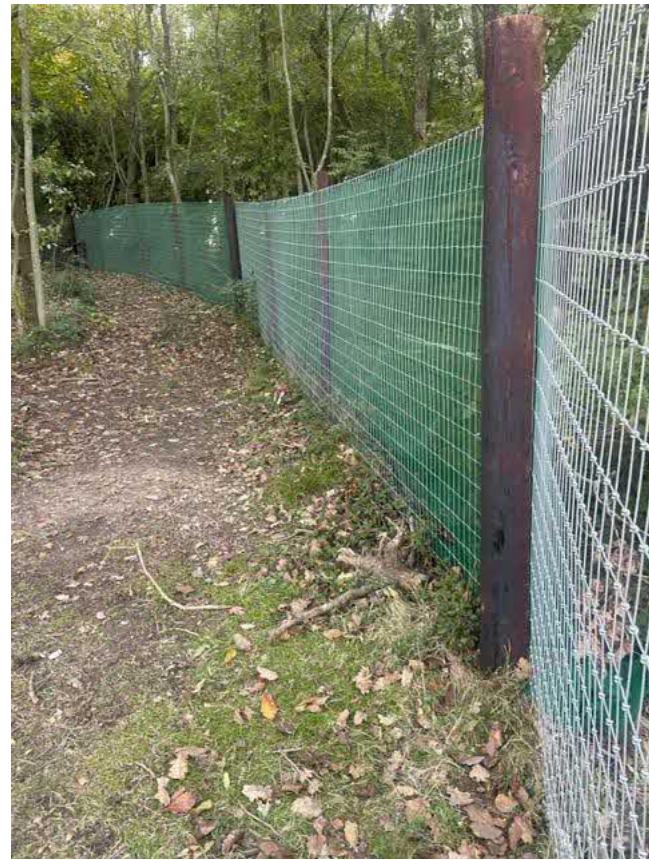
Example photo 1 (fencing)