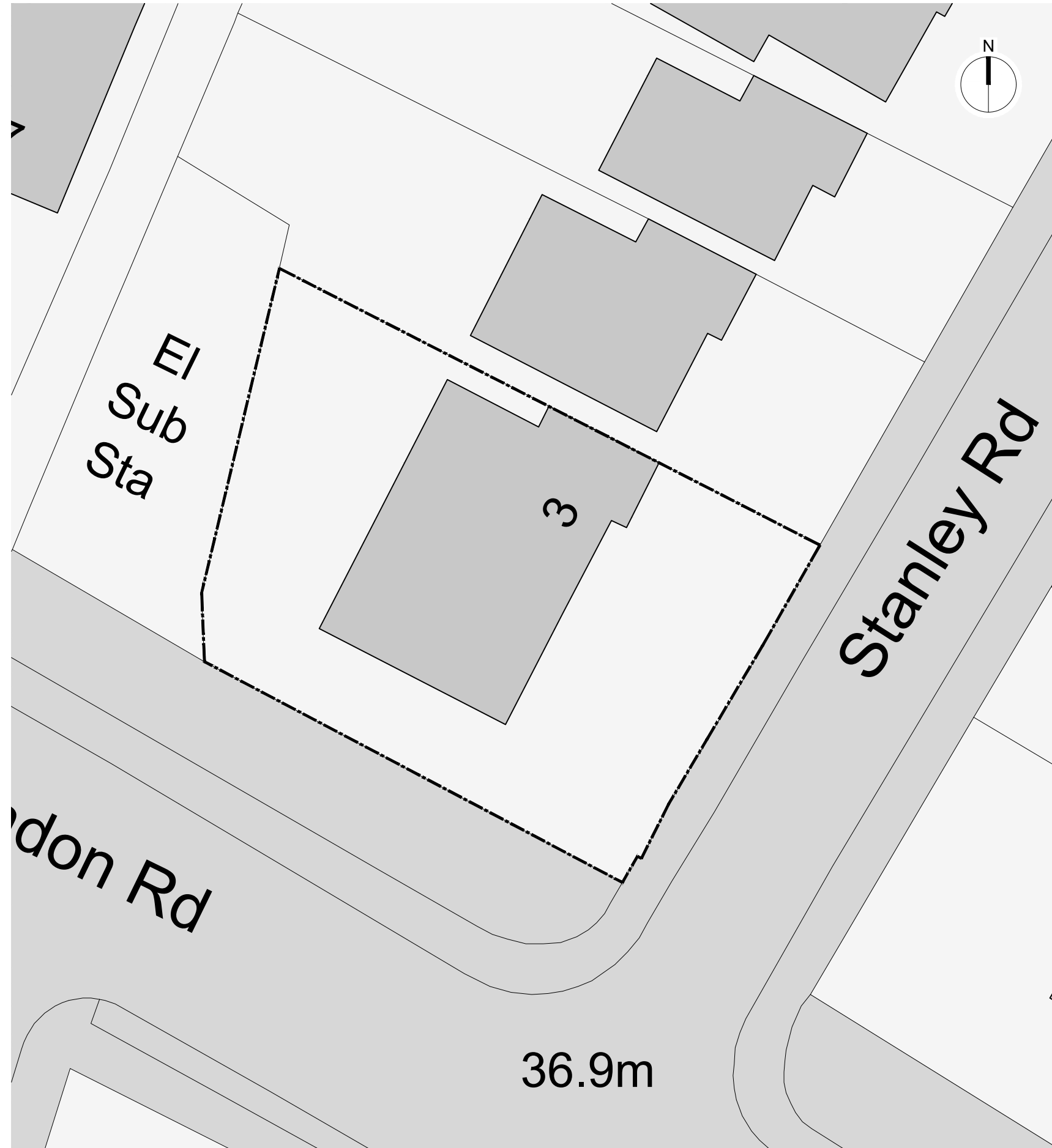
Site Plan Scale: 1:200