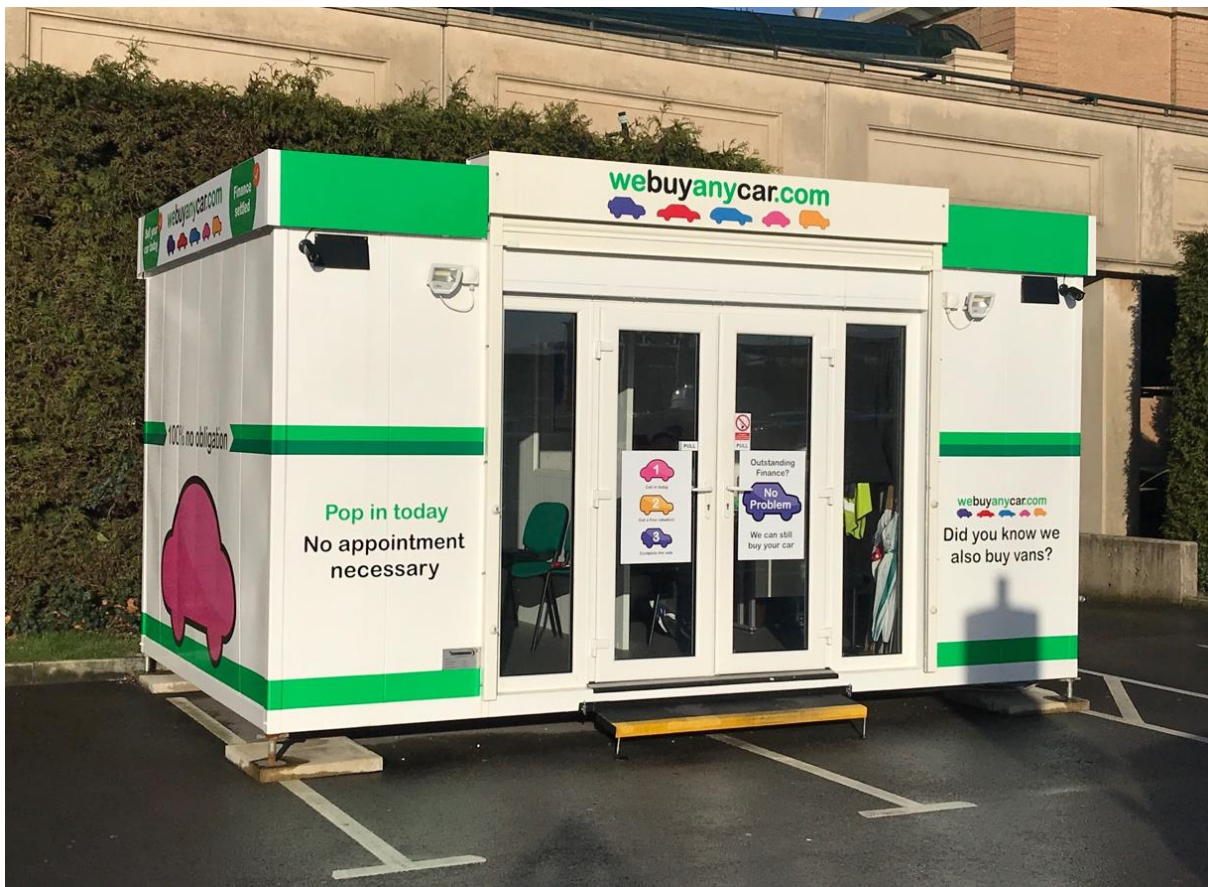
Example image of a WeBuyAnyCar.com operation.