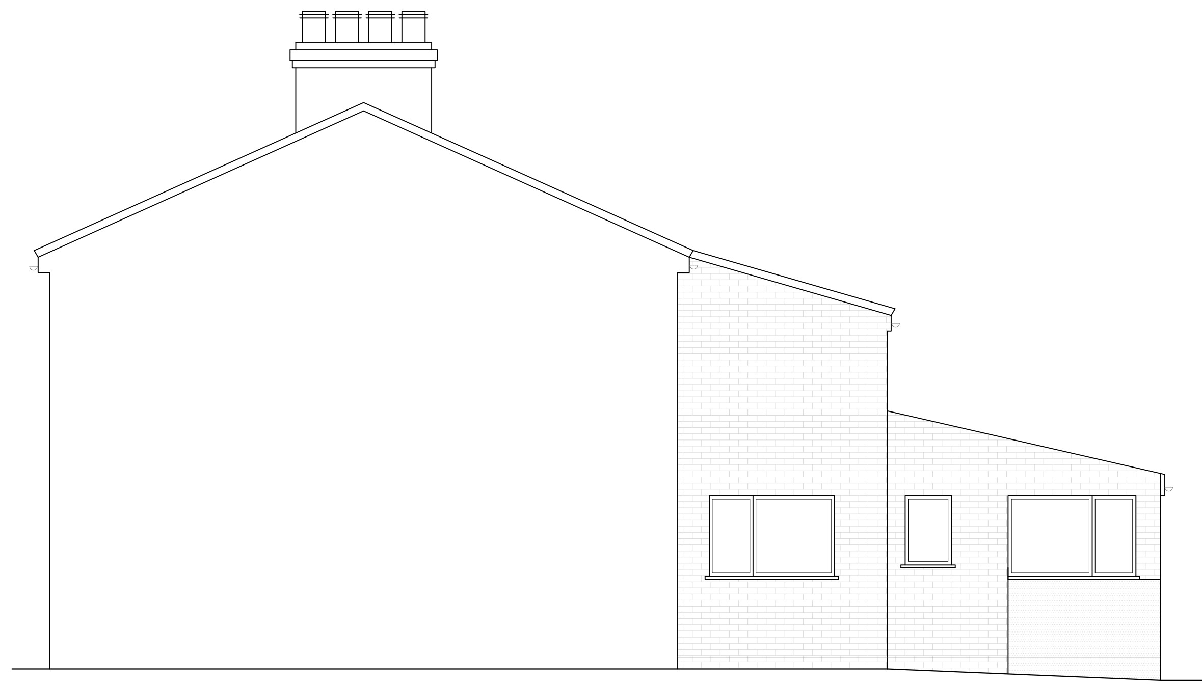
SIDE ELEVATION - EXISTING