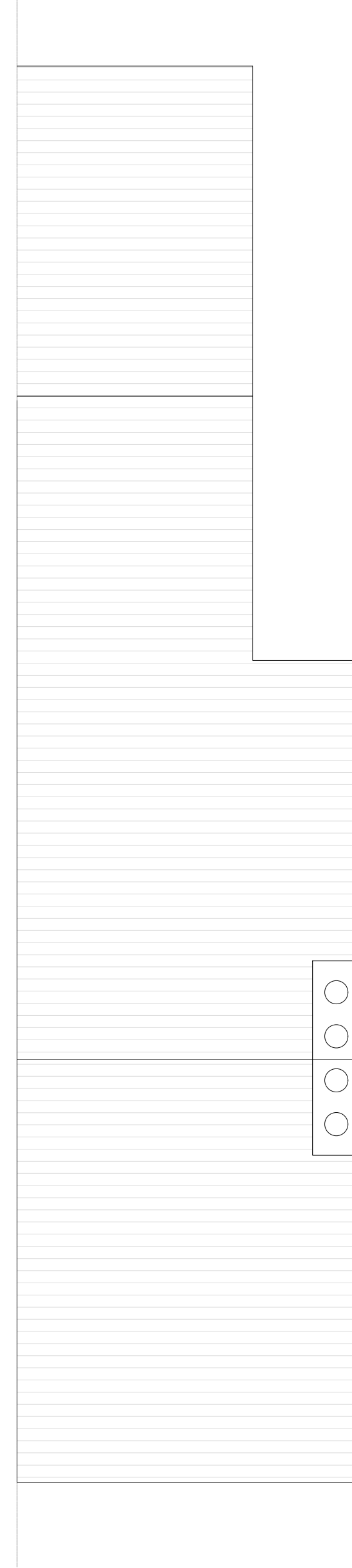
ROOF PLAN - EXISTING