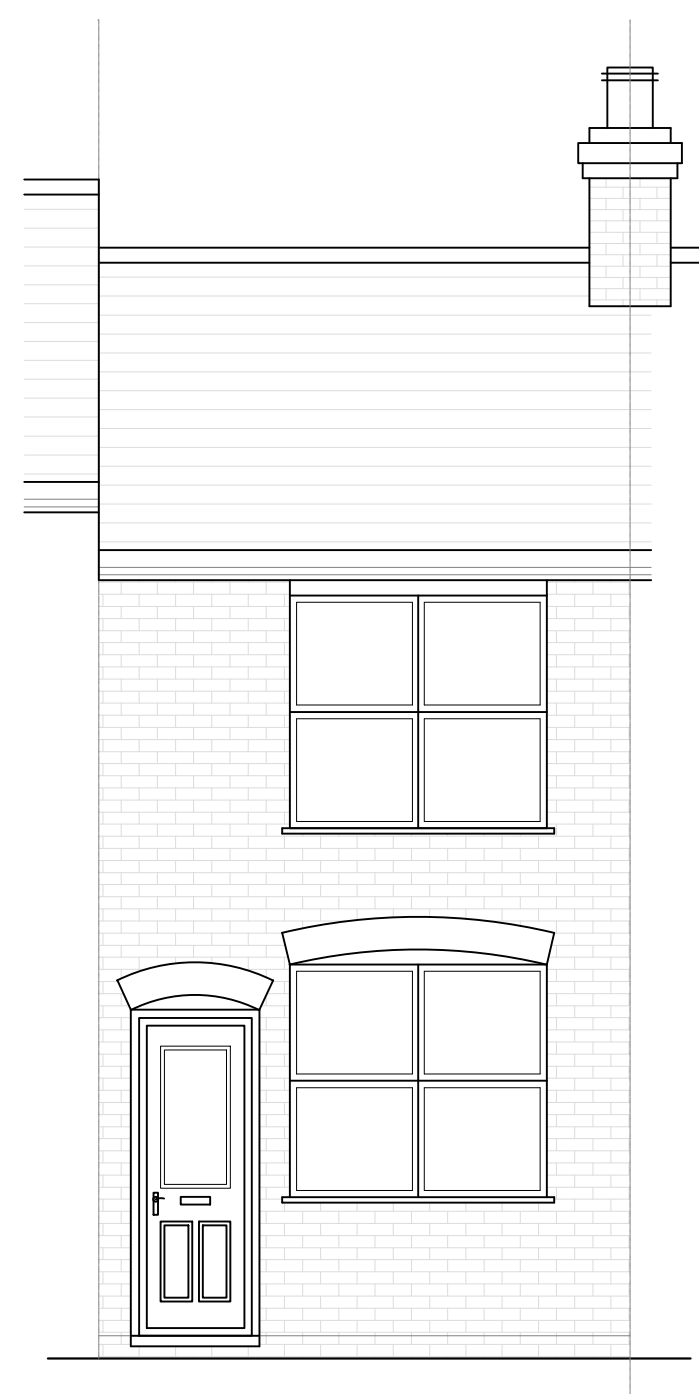
FRONT ELEVATION - EXISTING