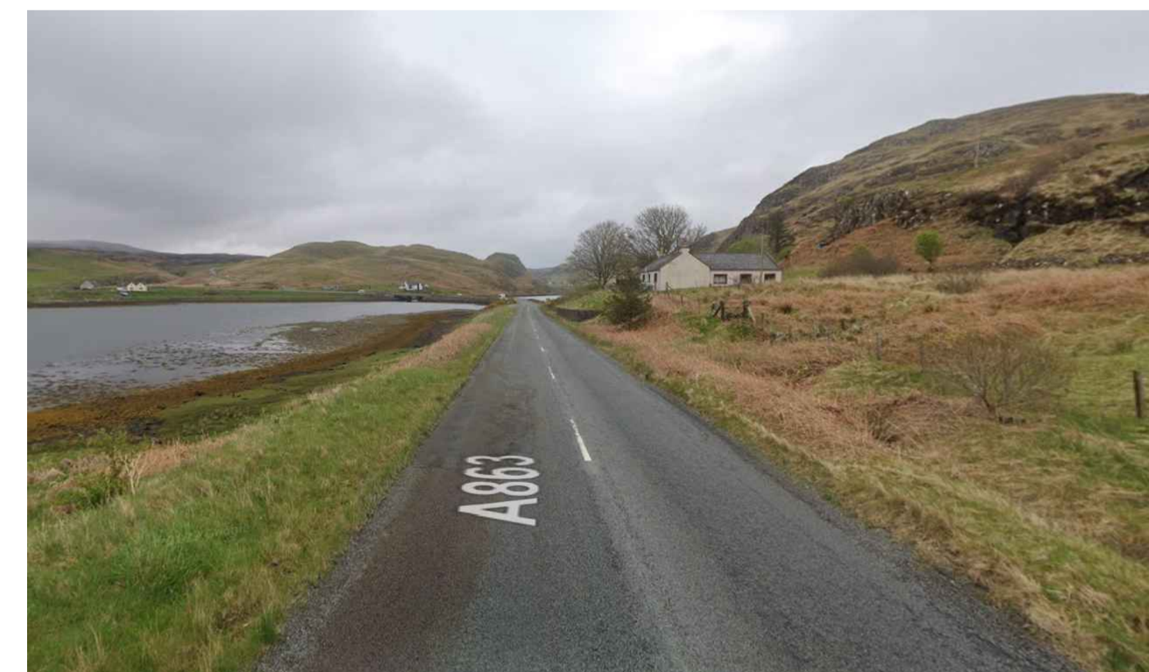
3. Facing northeast on A863 adjacent to site access.