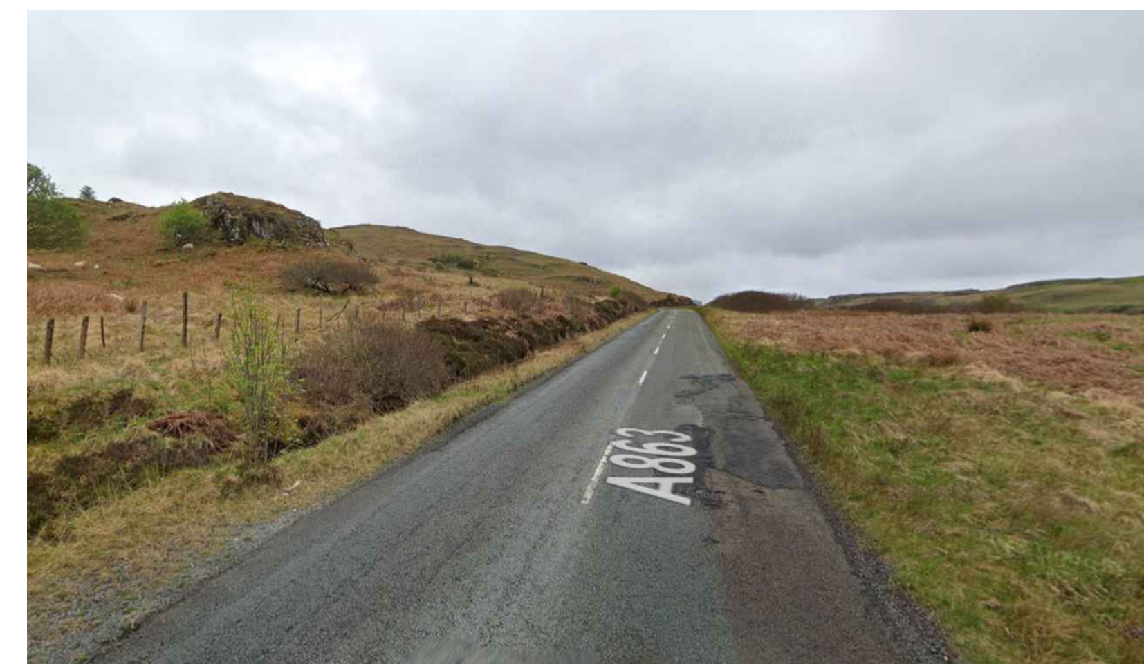
2. Facing southwest on A863 adjacent to site access.