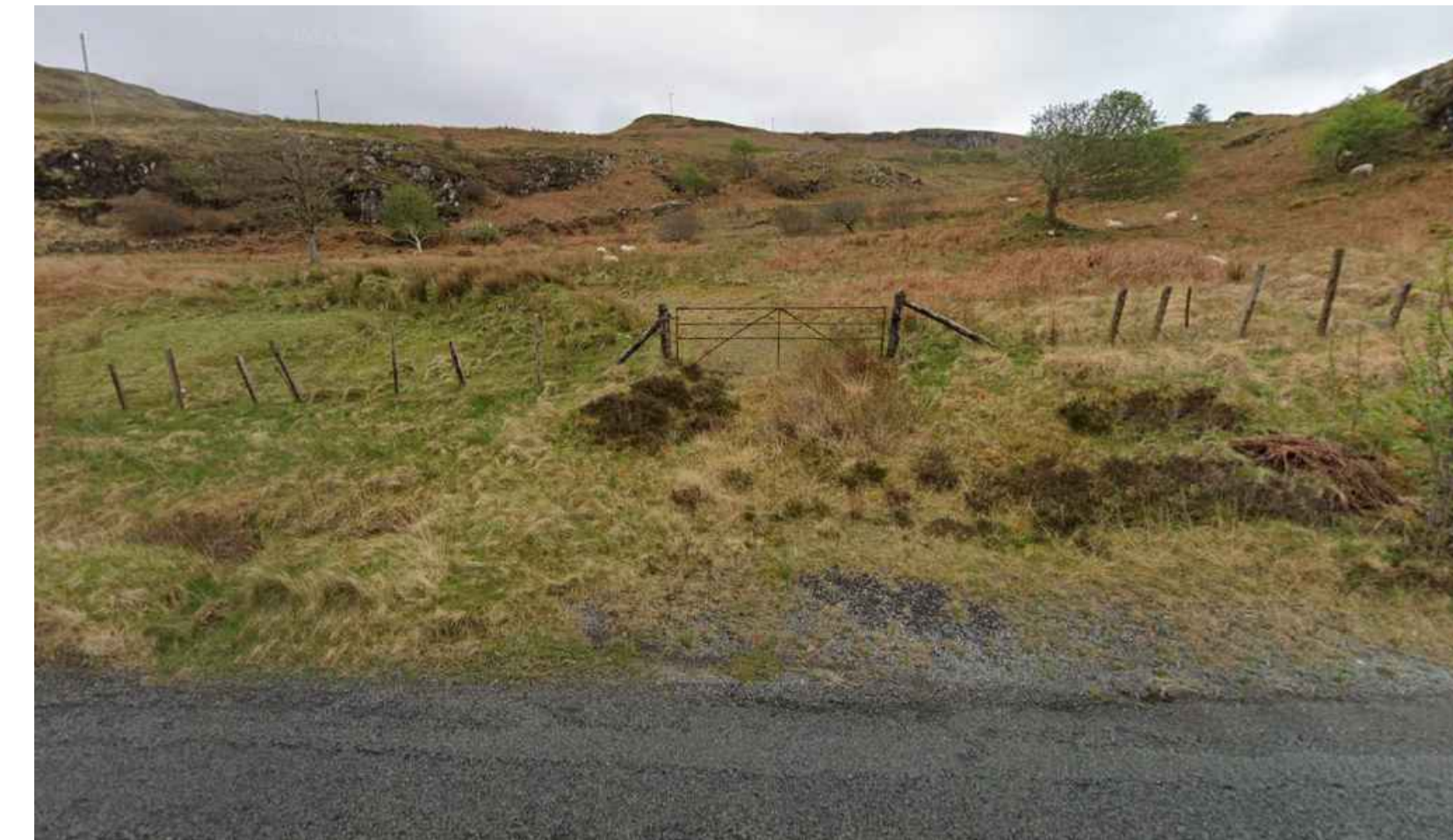
1. Existing field access to be utilised as site entrance.