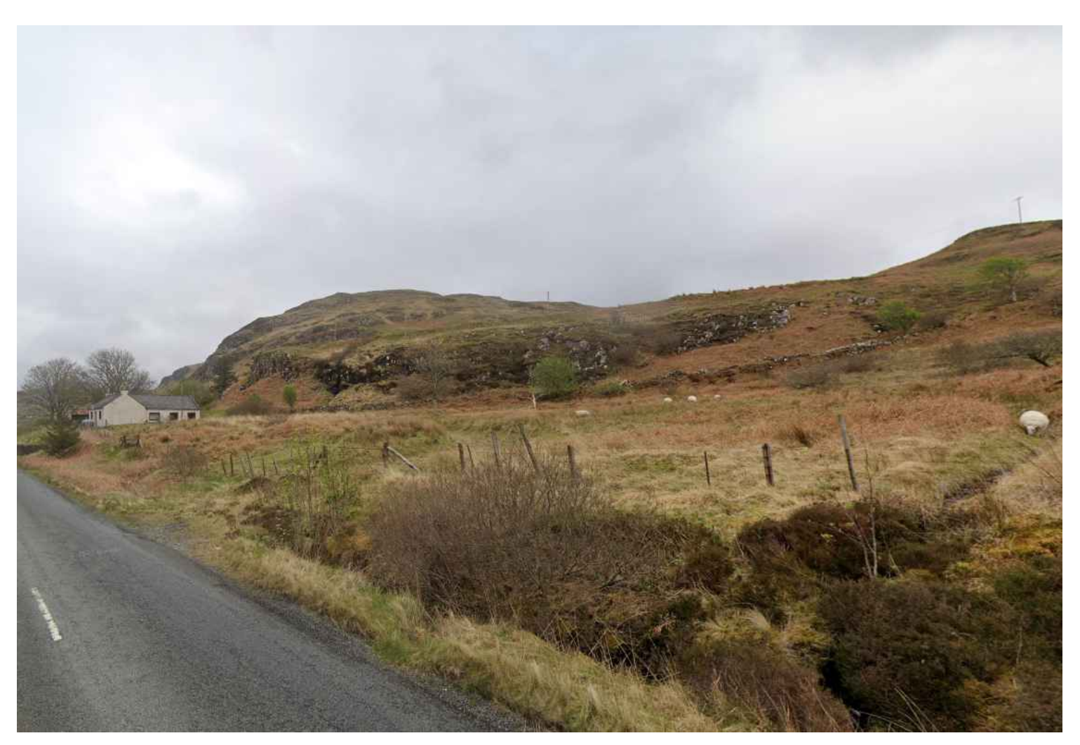
2. Facing northeast from public road across full site and Applicant's dwelling.