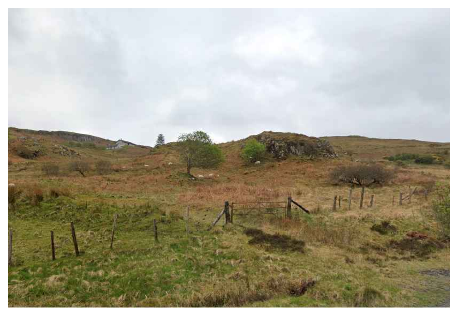
3. Existing site access (to be improved per Road and Access drawing) and proposed location for P2 on left of photo and P3 on right of photo.