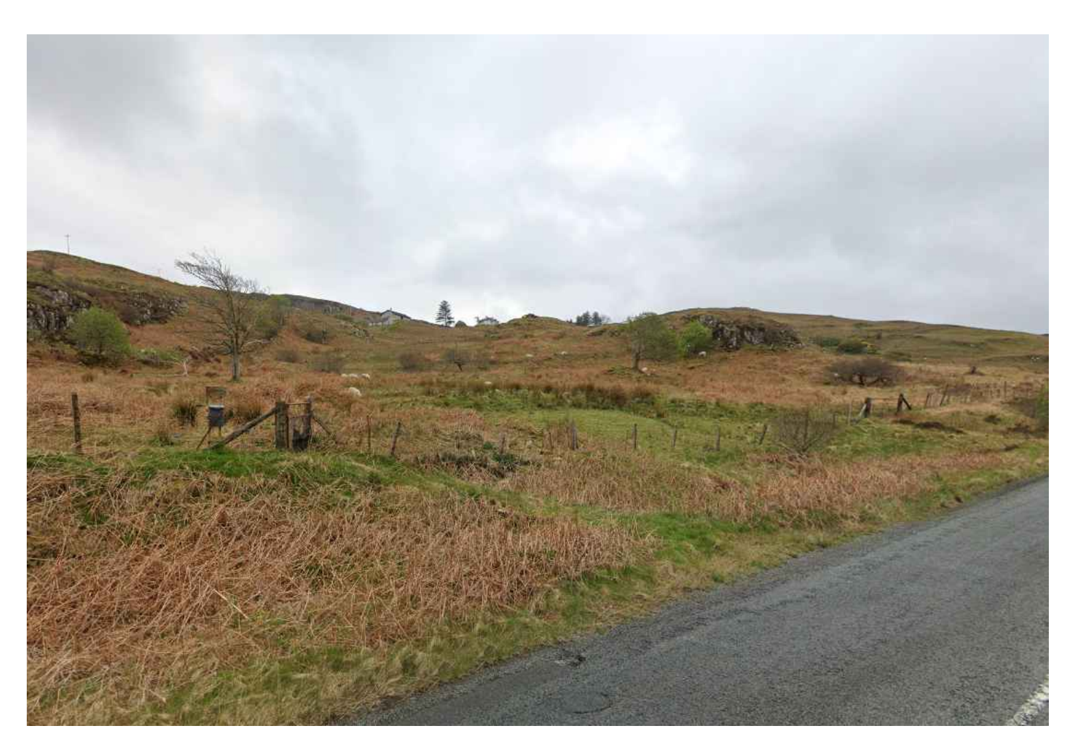
1. Facing southeast from public road across full site.