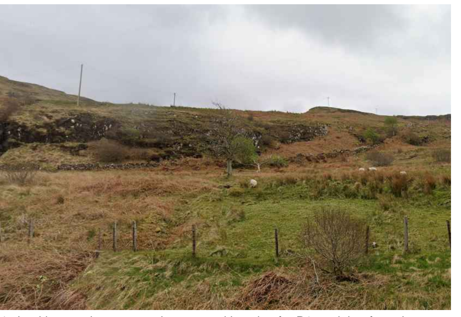
4. Looking southeast towards proposed location for P1 on right of tree in centre of photo and storage shed / barrel sauna on left. Treated outflow from water treatment tank directed to wet ditch centre-left of photo.