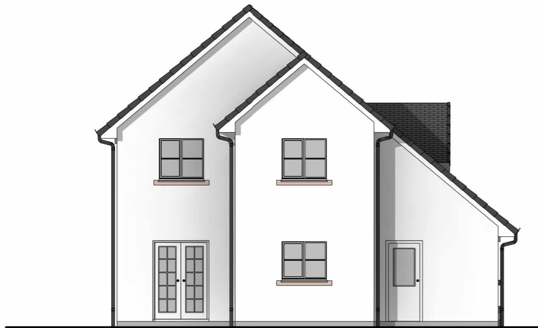
North 1 : 100