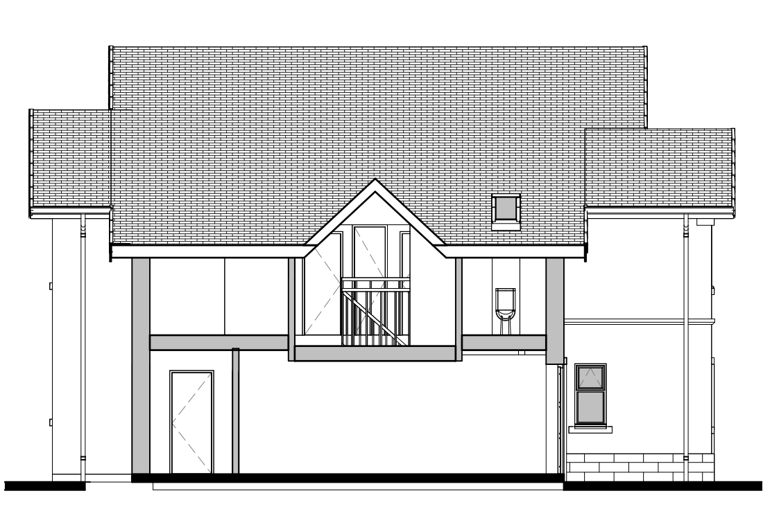
Section 1 1:100