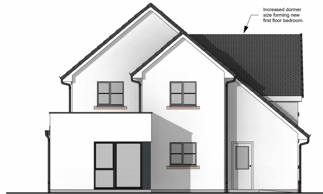
North 1 : 100