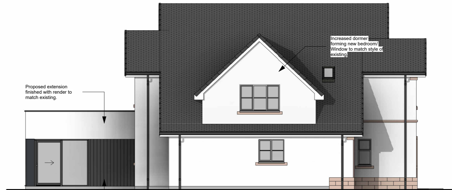
West 1 : 100