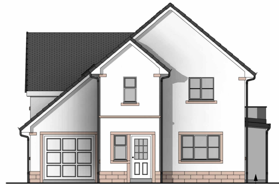
South 1 : 100