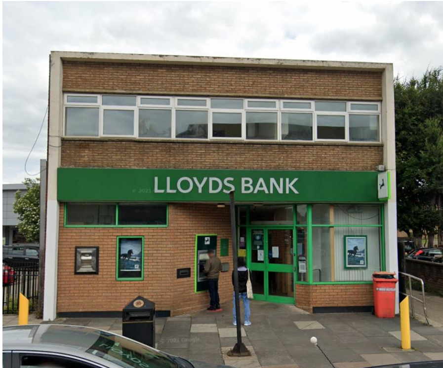
Figure 1: Existing Front Elevation of Lloyds Bank