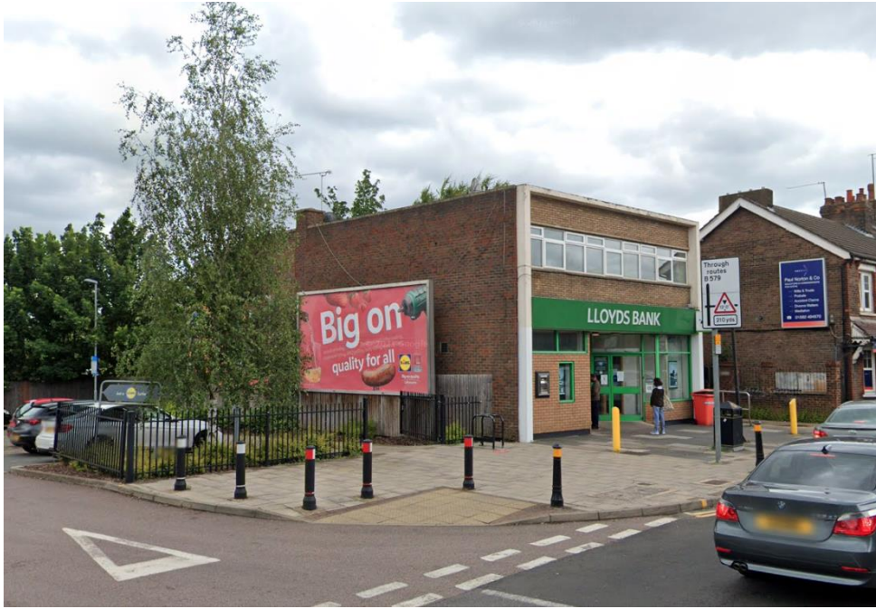
Figure 3: Existing Side/Front Elevation of Lloyds Bank