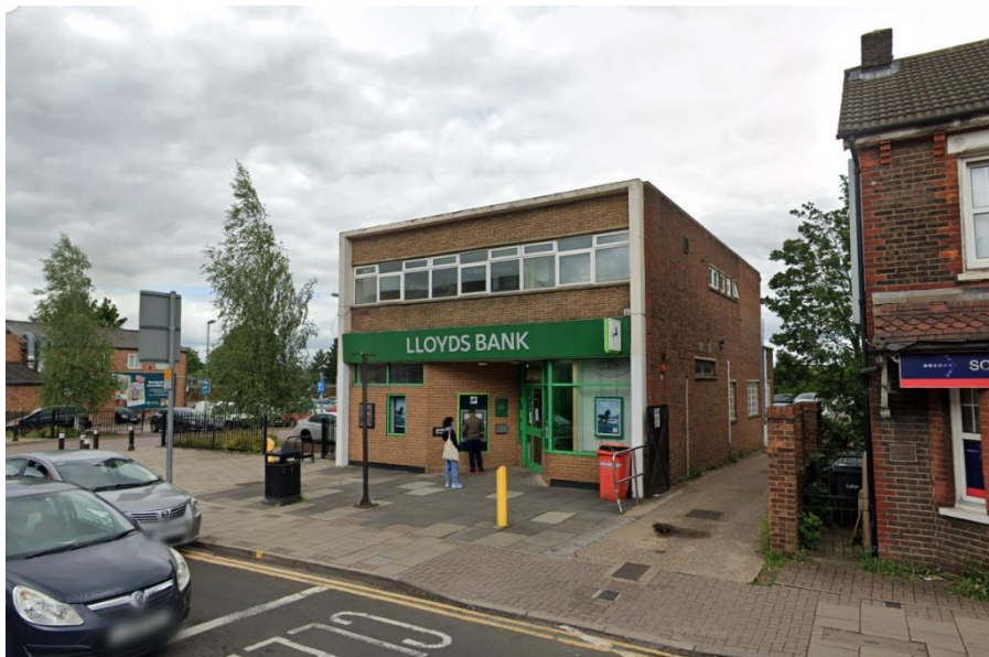
Figure 2: Existing Side/Front Elevation of Lloyds Bank