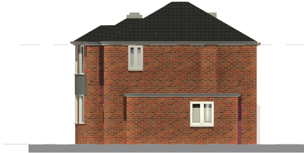
EXISTING AND PROPOSED SOUTH ELEVATION 1:100