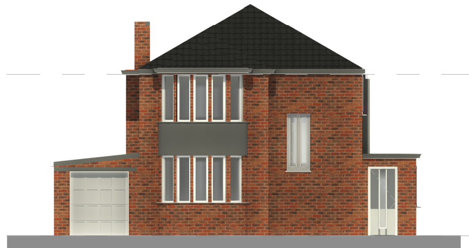
EXISTING AND PROPOSED WEST ELEVATION 1:100