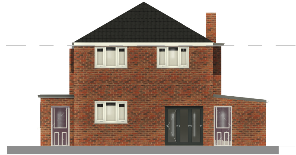
EXISTING AND PROPOSED EAST ELEVATION 1:100