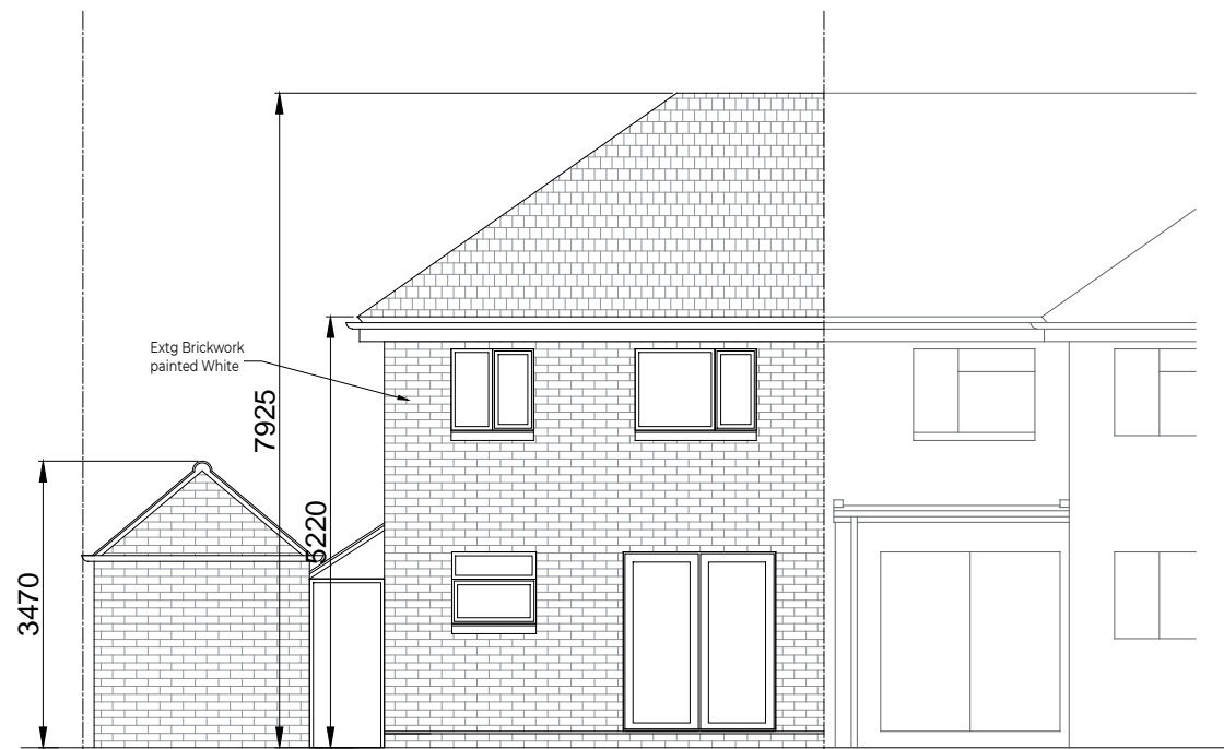
Existing Rear Elevation (West)