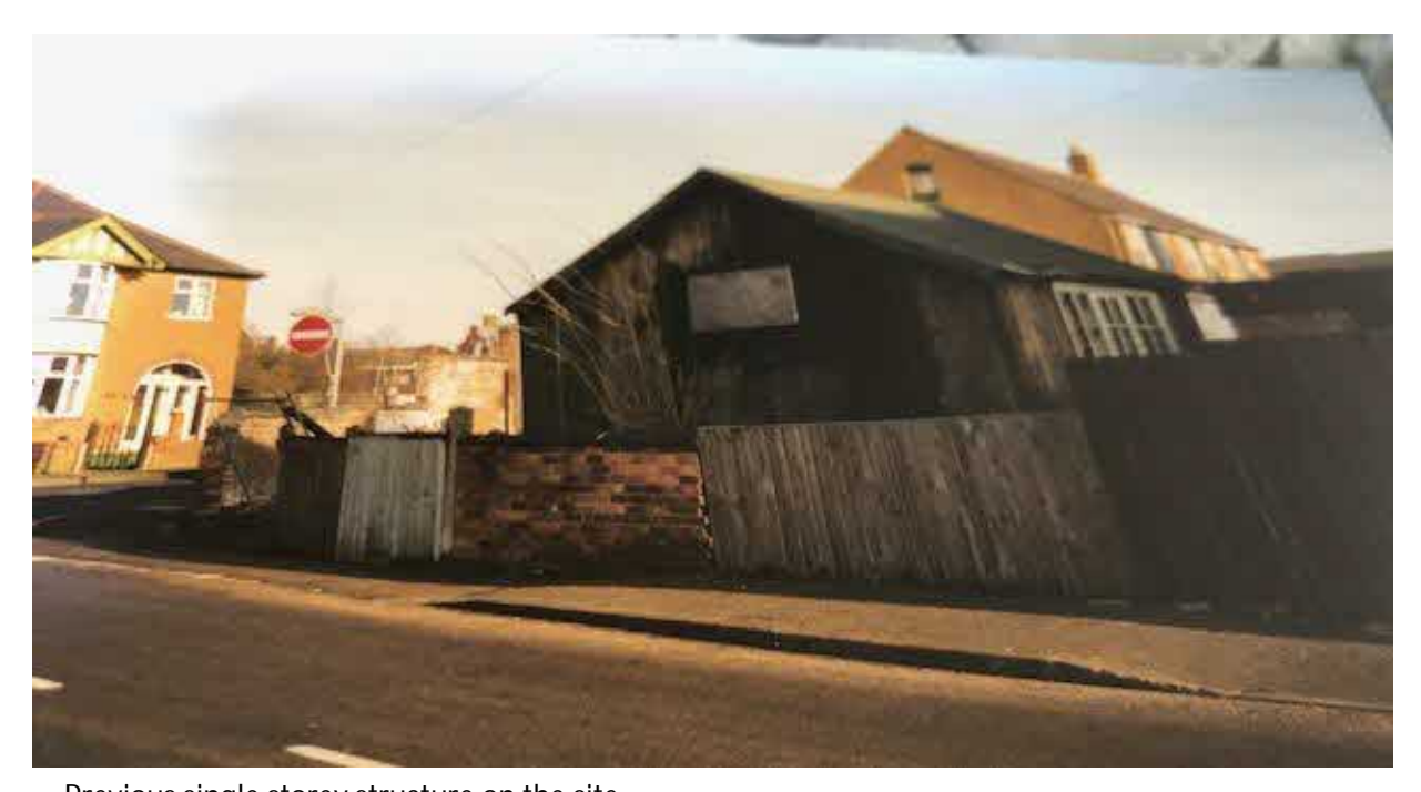
Previous single storey structure on the site