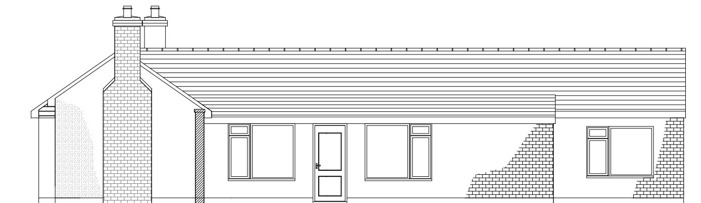
Existing Side 1 Elevation