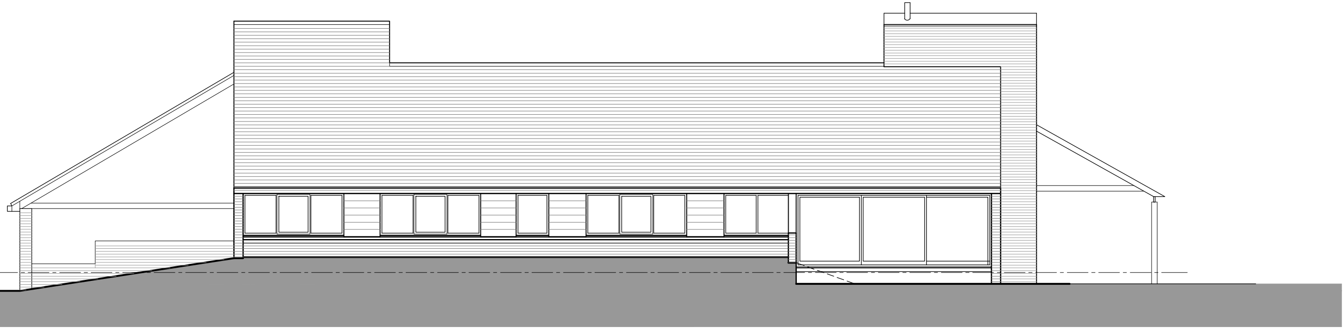
2 South Elevation