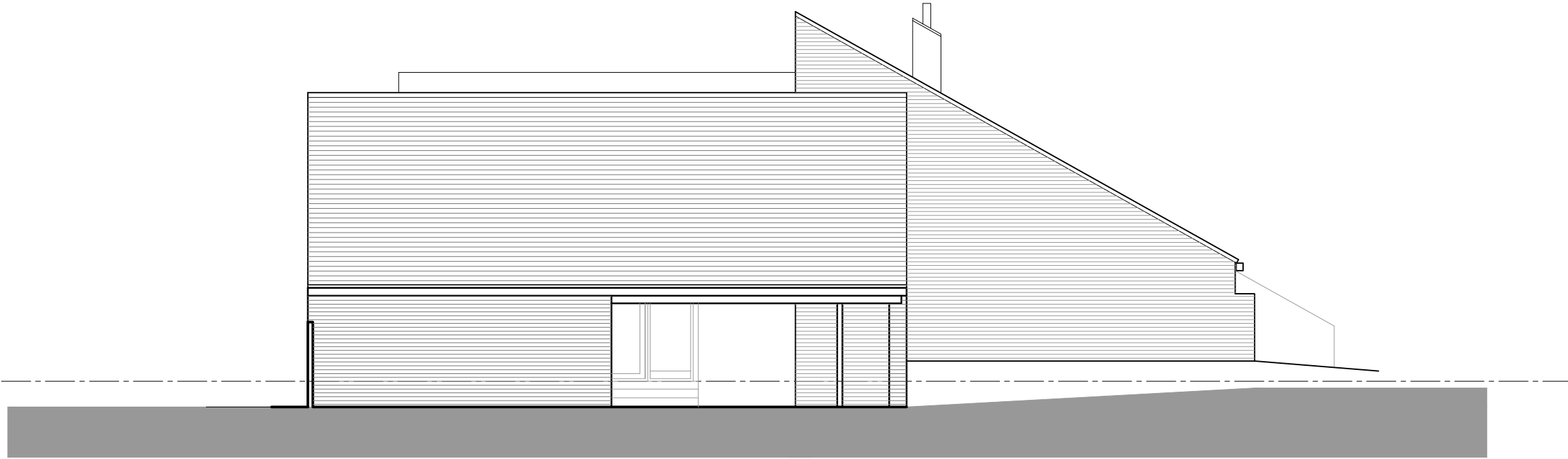
1 West Elevation