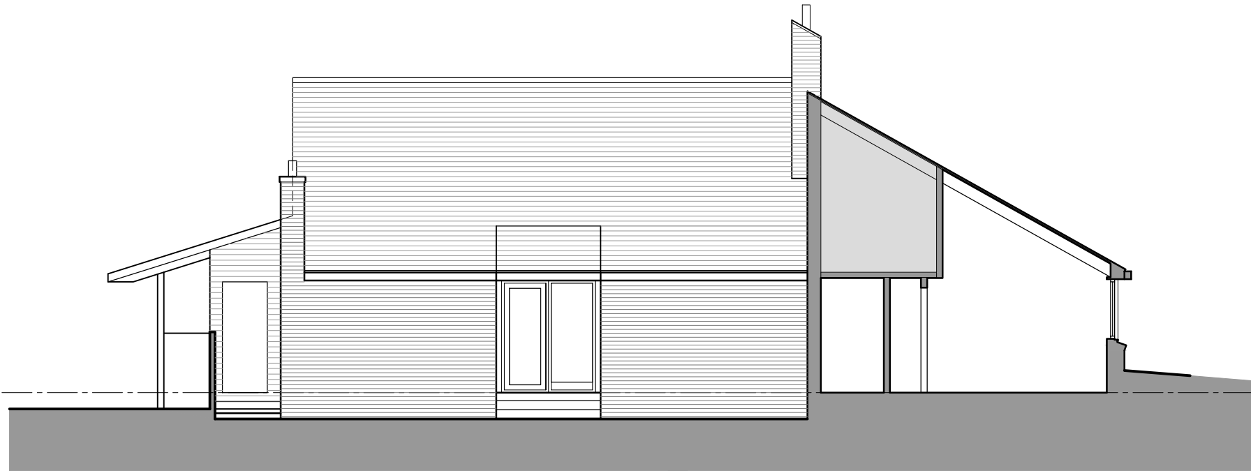
1 West Elevation