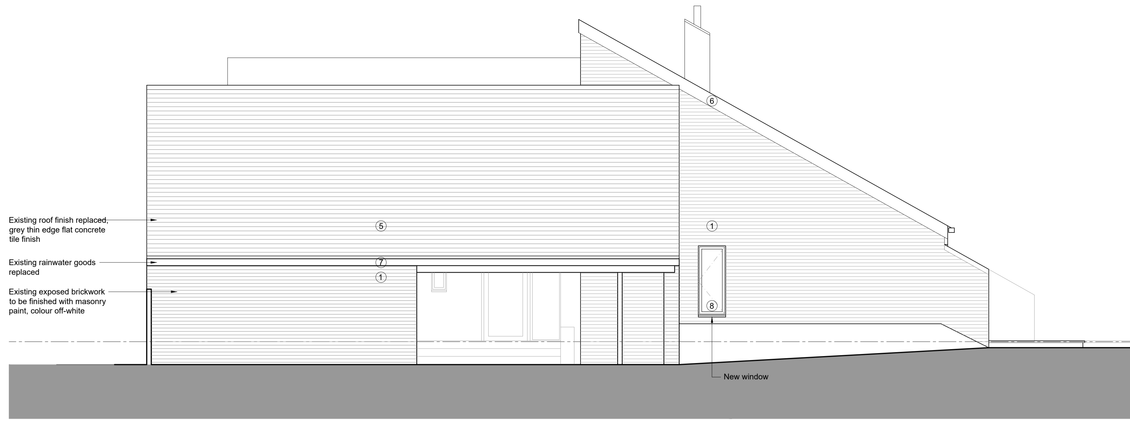
1 West Elevation