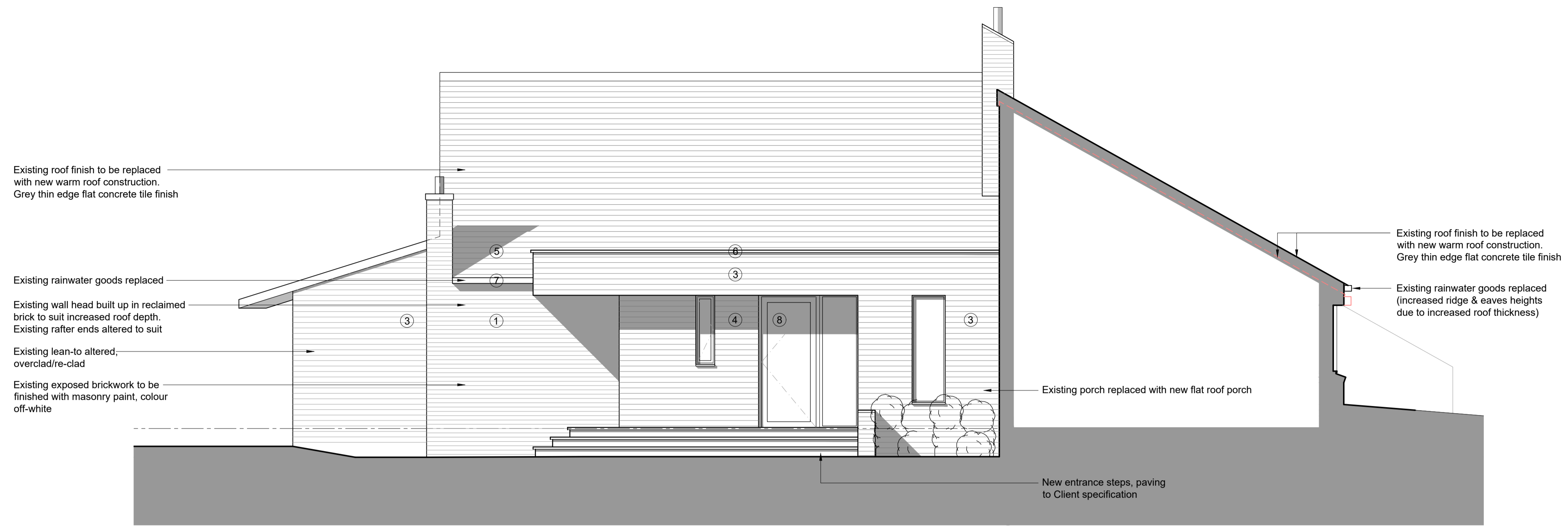
1 West Elevation