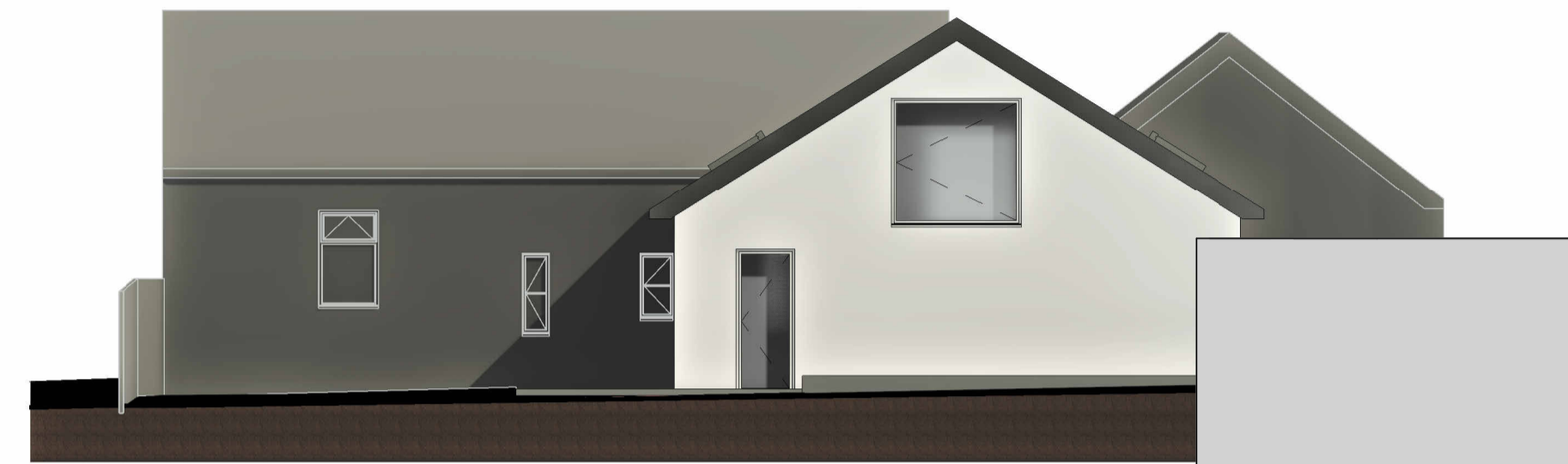
West Elevation 1 : 100