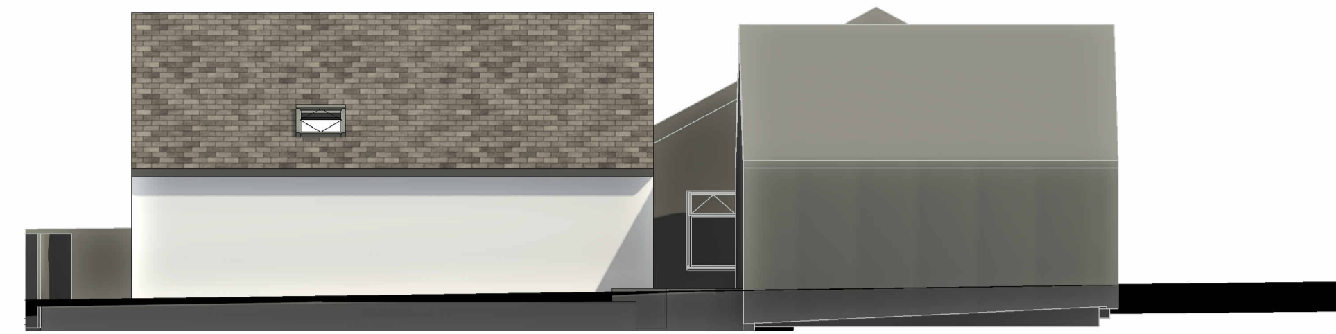
South Elevation 1 : 100