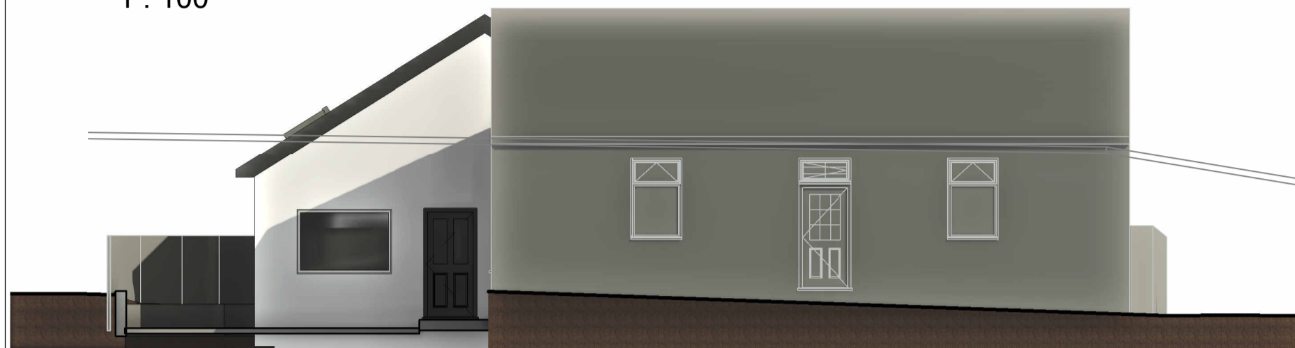
East Sectional Elevation 1 : 100