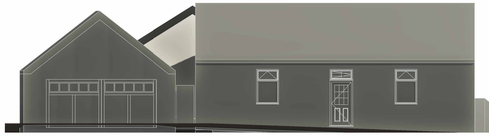
East Elevation 1 : 100