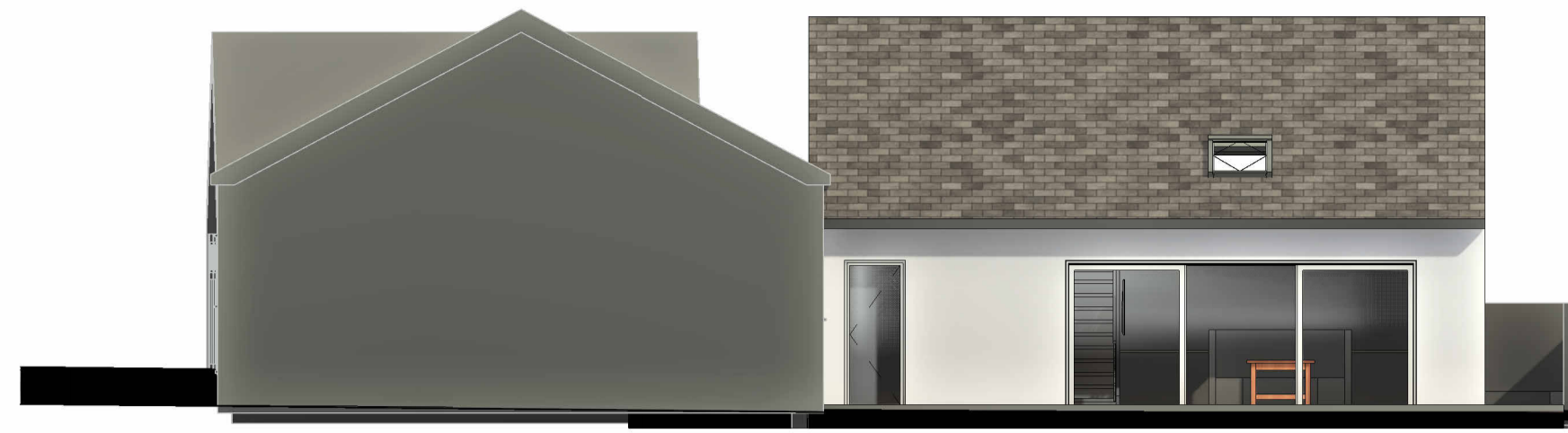
North Elevation 1 : 100