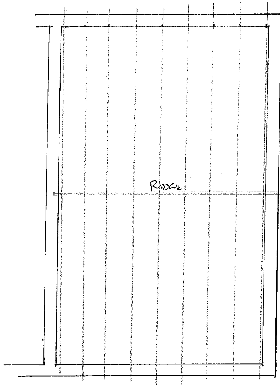
EXISTING ATM PLAN 1:50 @ A3