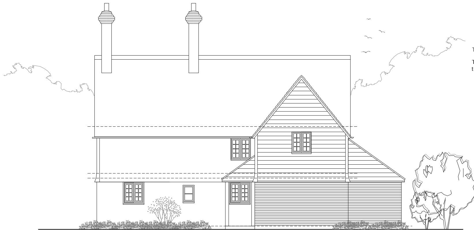
REAR / NORTH-WEST

Tiled roof finish to match existing Traditional white feather edged timber weather boarding