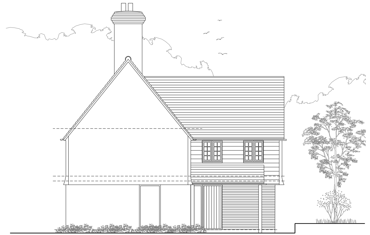
SIDE / NORTH-EAST