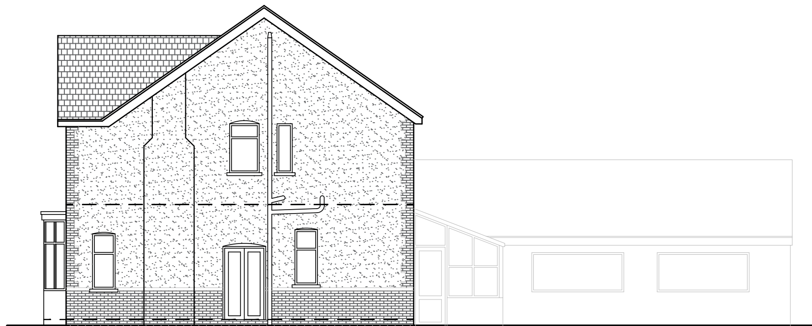
EXISTING NORTHWEST ELEVATION 1:100