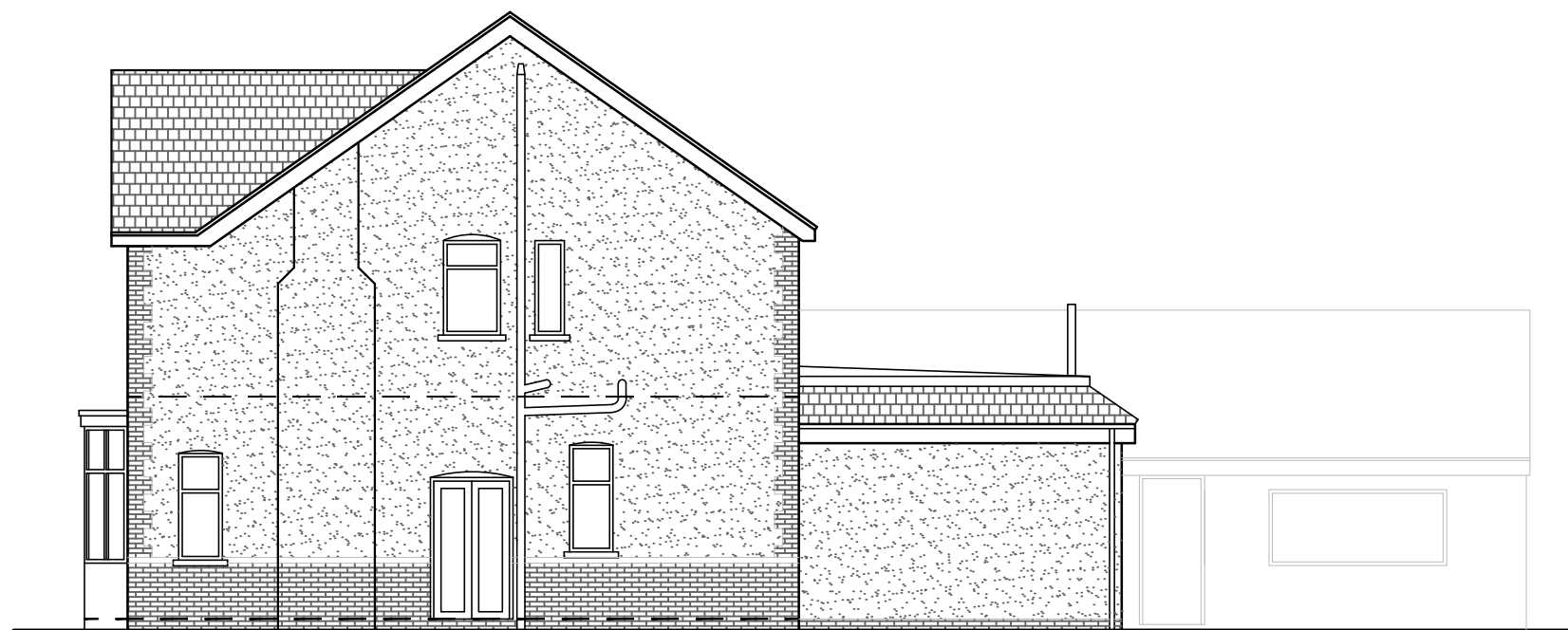
PROPOSED NORTHWEST ELEVATION 1:100