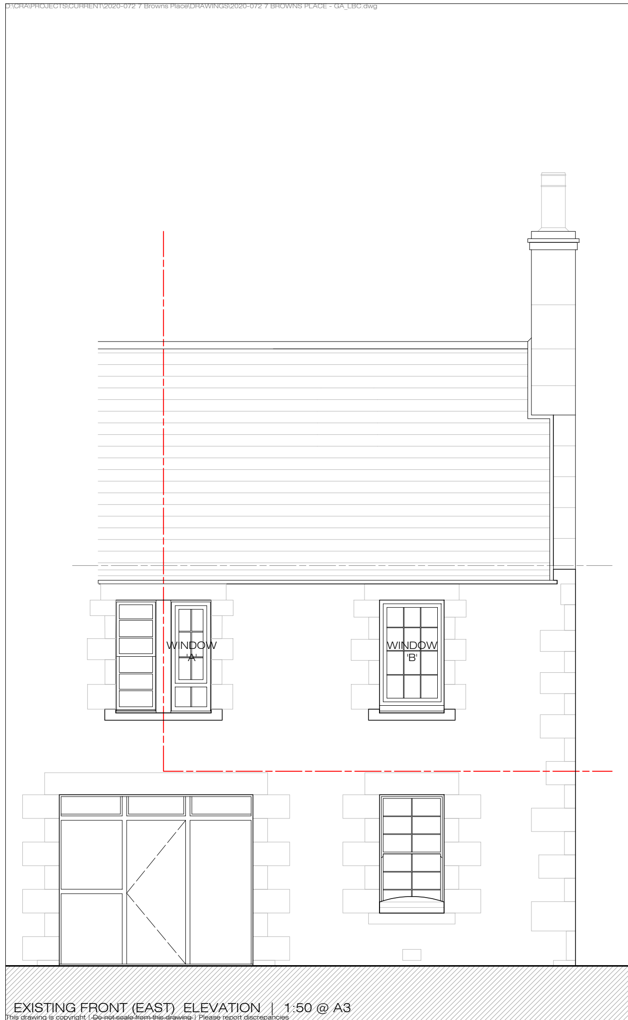
EXISTING FRONT (EAST) ELEVATION | 1:50 @ A3

NOTE: Existing Site Boundary information taken from official O.S. Data and basic on-site dimension check, however a detailed Land Survey is recommended in due course.