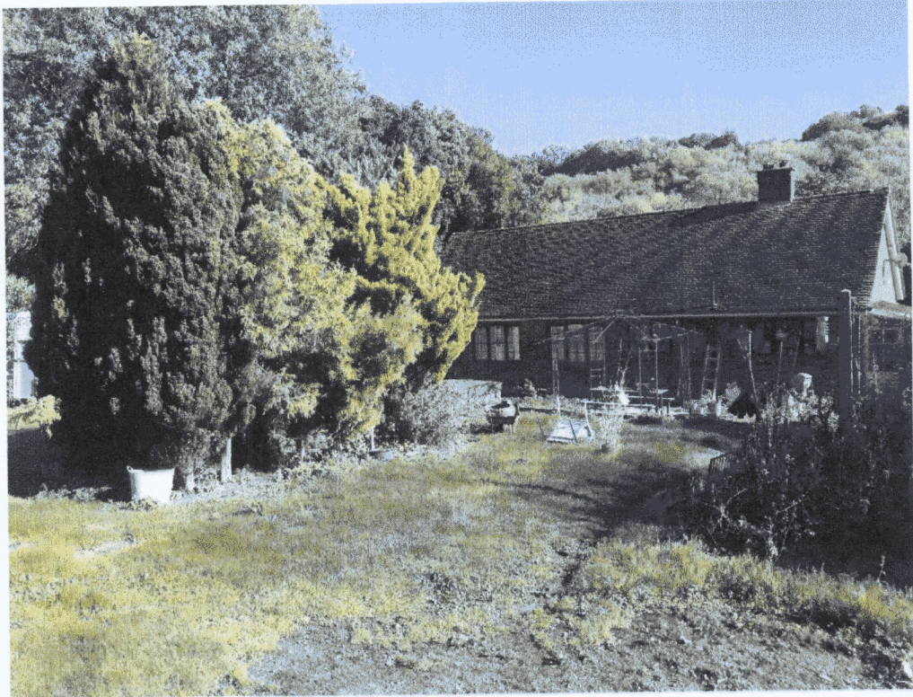
Rear curtilage and rear of bungalow