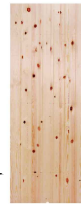
78X24 Redwood Ledged & Braced Door

£0.94 Ex VAT £1.13 Inc VAT Please enter your location below for stock availability.