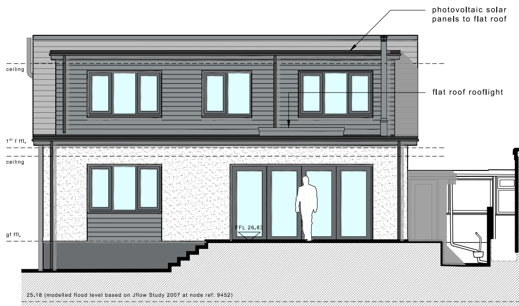
south elevation - proposed @ 1:100