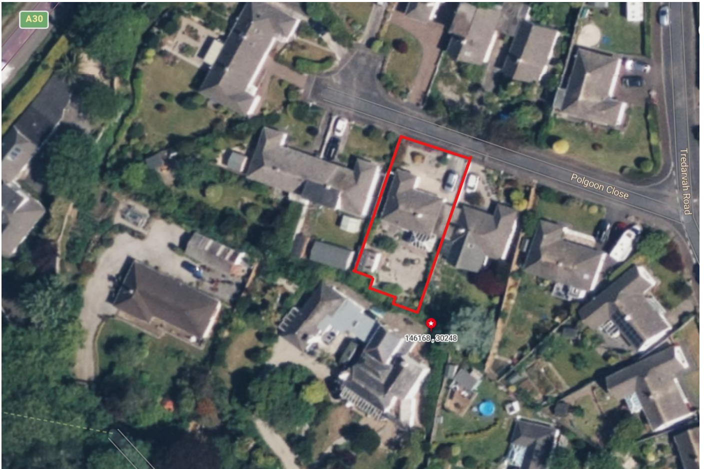
Image 05: Map extract identifying 3 Polgoon Close and location of Jflow Study Node Reference 9452