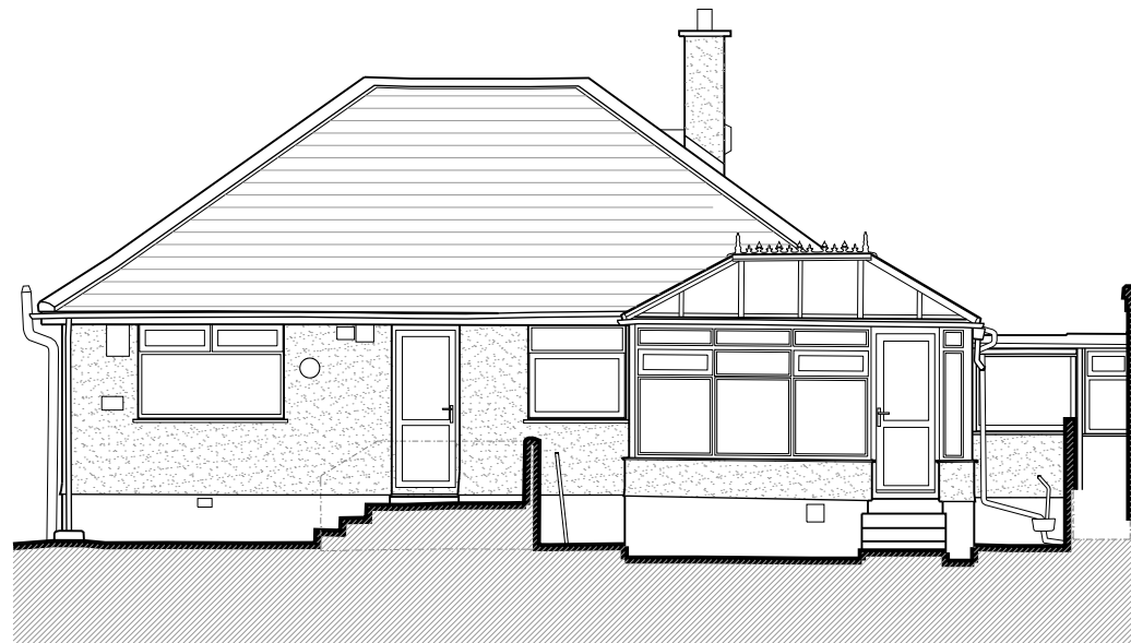
south elevation - existing