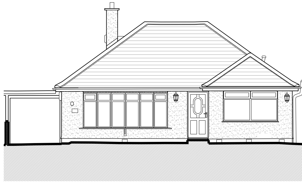
north elevation - existing