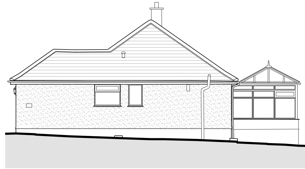
west elevation - existing