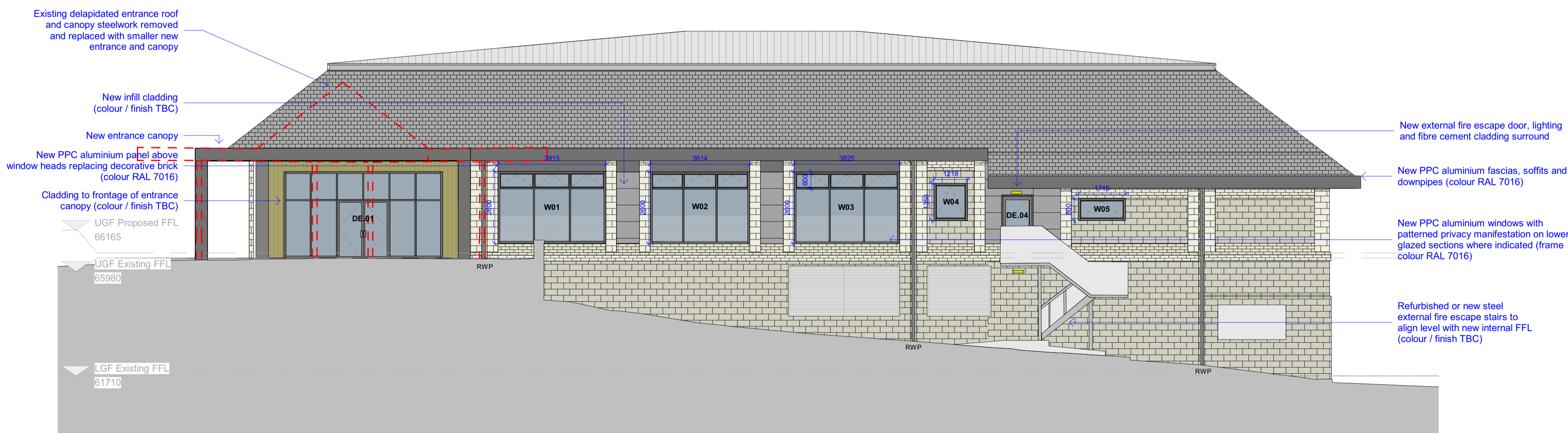
Proposed Elevation - North West 1 : 100