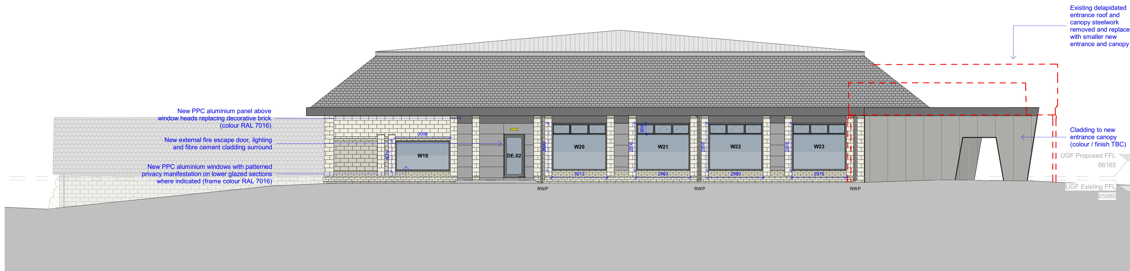
Proposed Elevation - North East 1 : 100