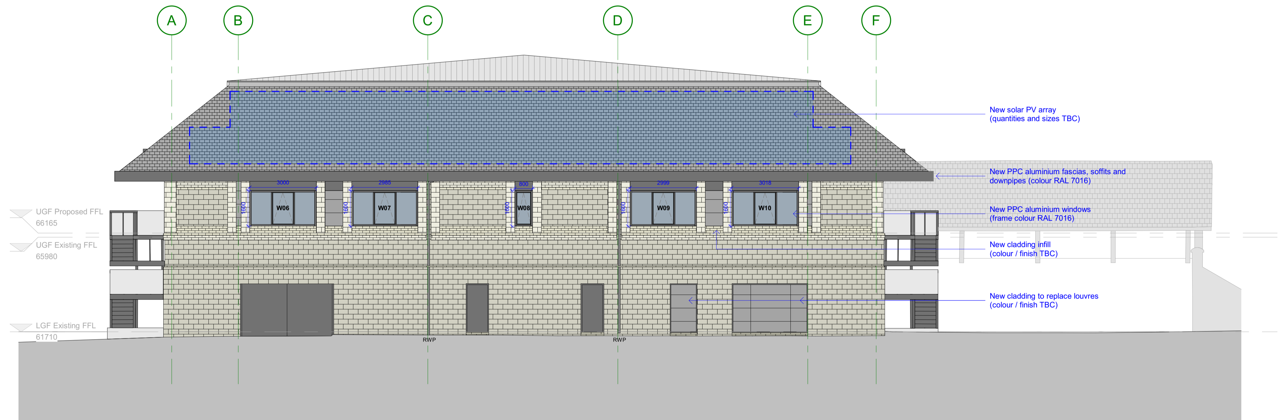
Proposed Elevations - South West 1 : 100

All dimensions to be checked on site prior to any works commencing