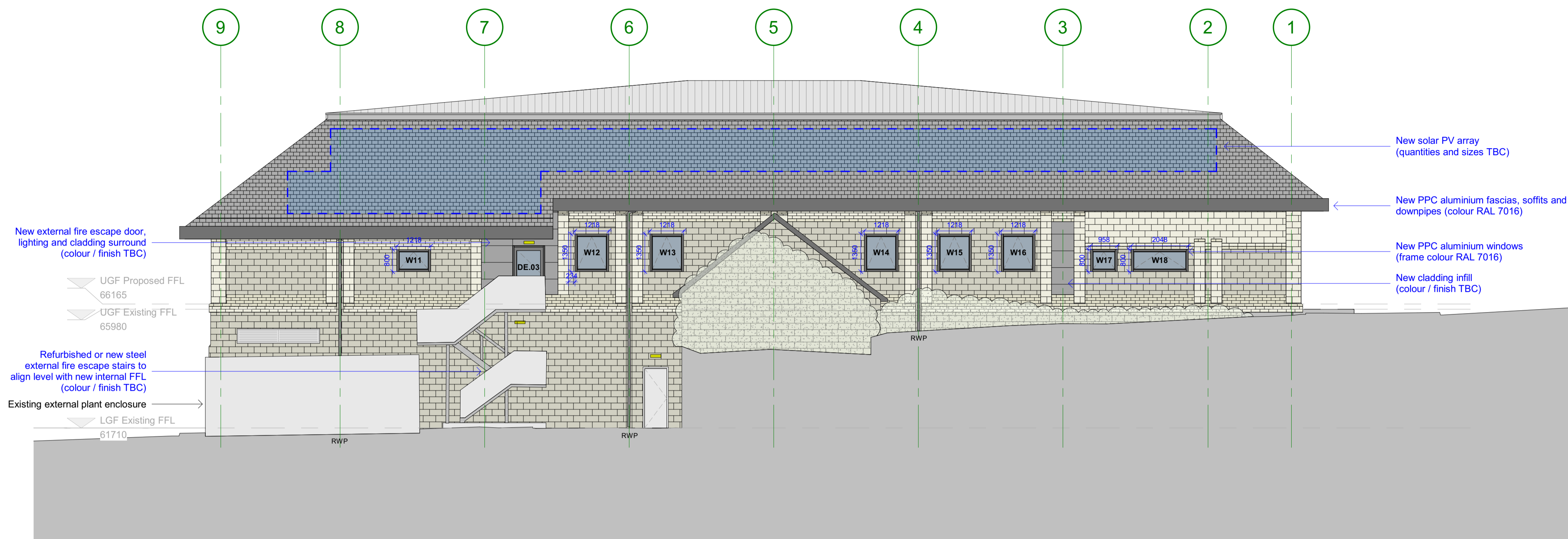
Proposed Elevations - South East 1 : 100