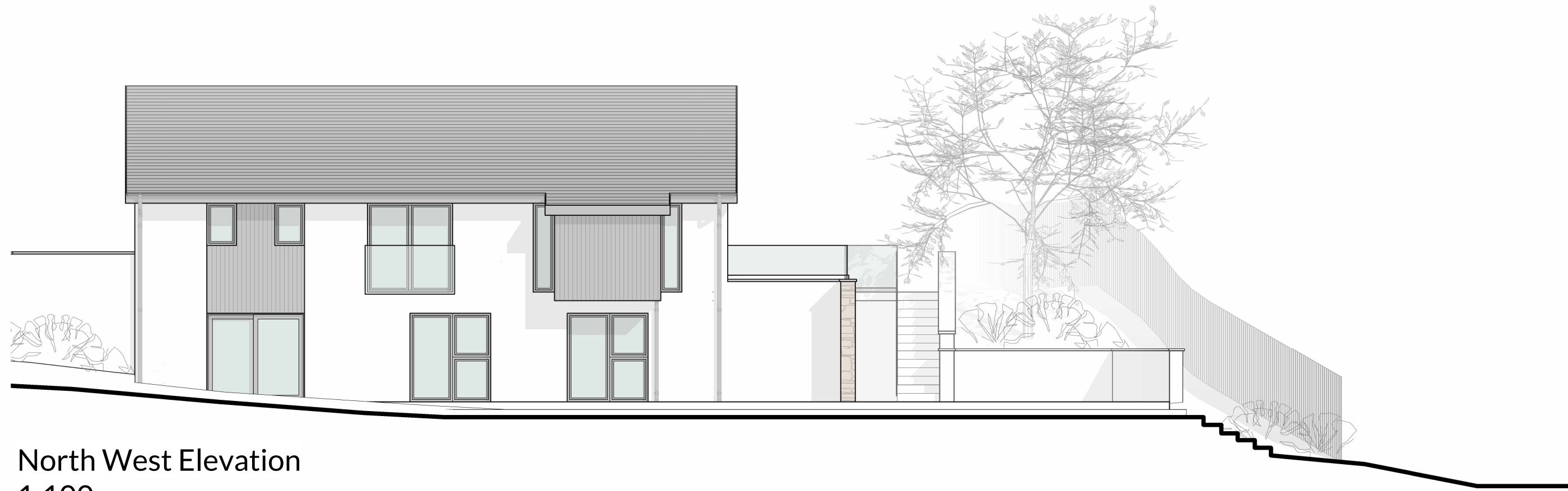
North West Elevation 1:100