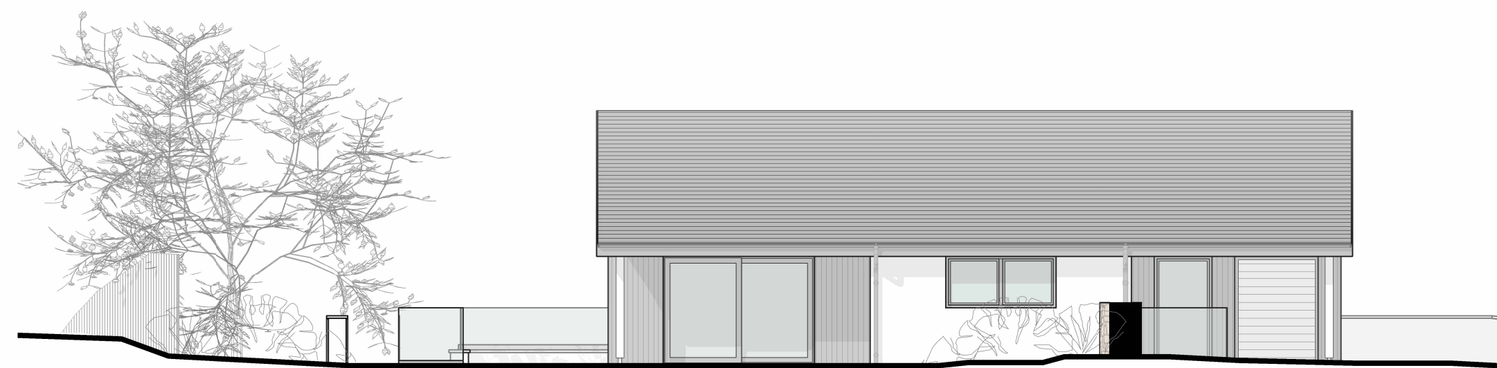
South East Elevation 1:100

A Date: 28.03.2024 Planning Submission Initial: TS REVISION