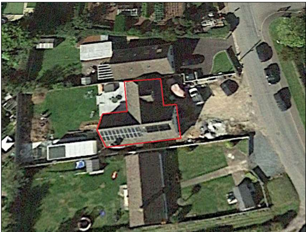
Figure 1. Location of Hazeldene. GoogleEarth September 2019.

SWE was commissioned by Mr and Mrs Cook to undertake an ecological assessment of a detached bungalow at Hazeldene, Station Road, Bow, EX17 6HU (Ordnance Survey grid reference SS721014 – see Figure 1). The survey was required to support a planning application for extending the property which would affect the roof space. The Devon Wildlife Checklist is appended to this report.