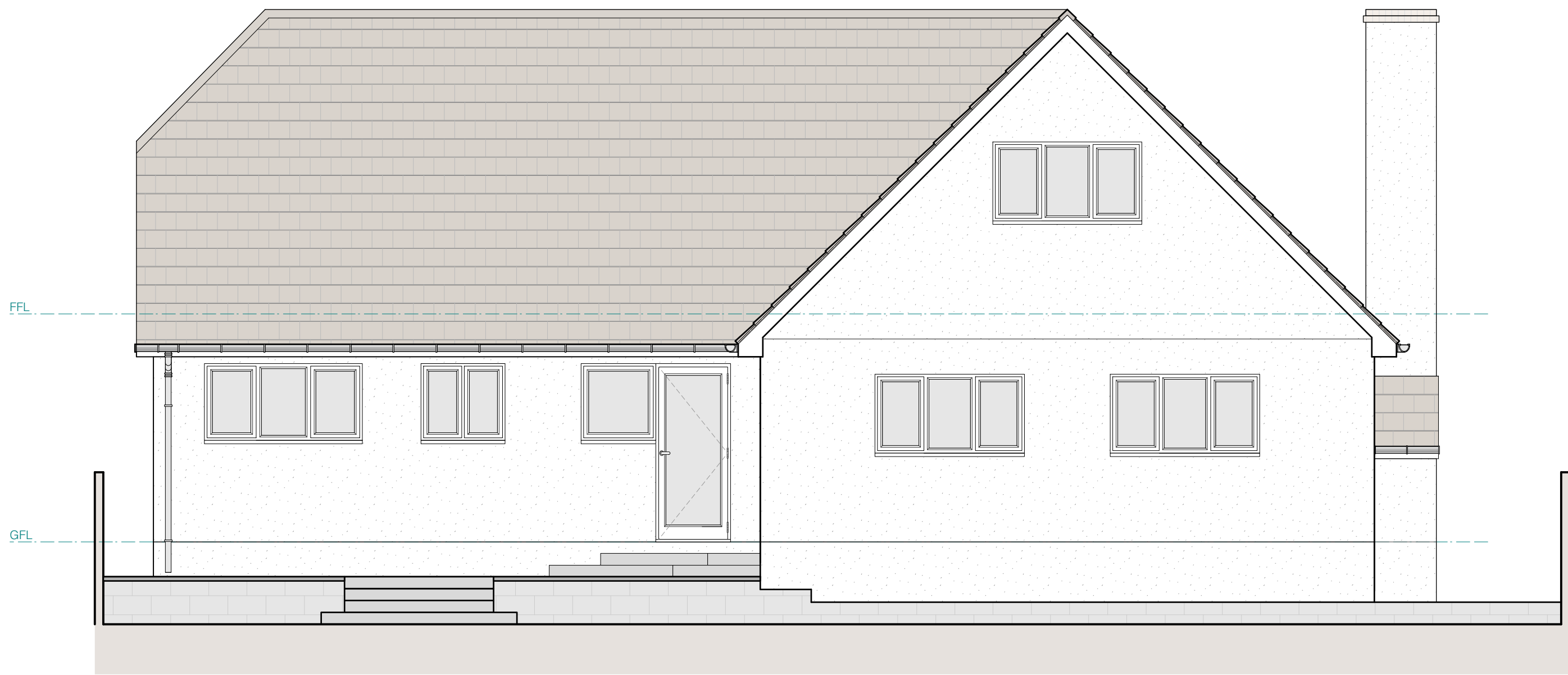
Existing West Elevation 1:50