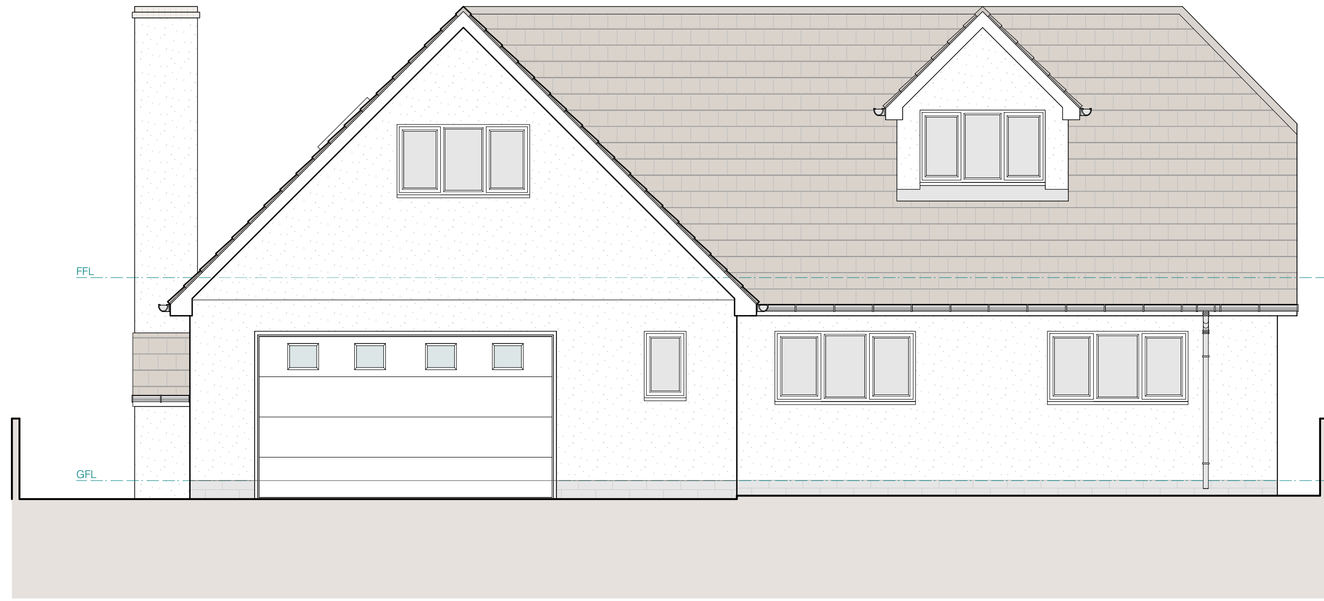
Existing East Elevation 1:50