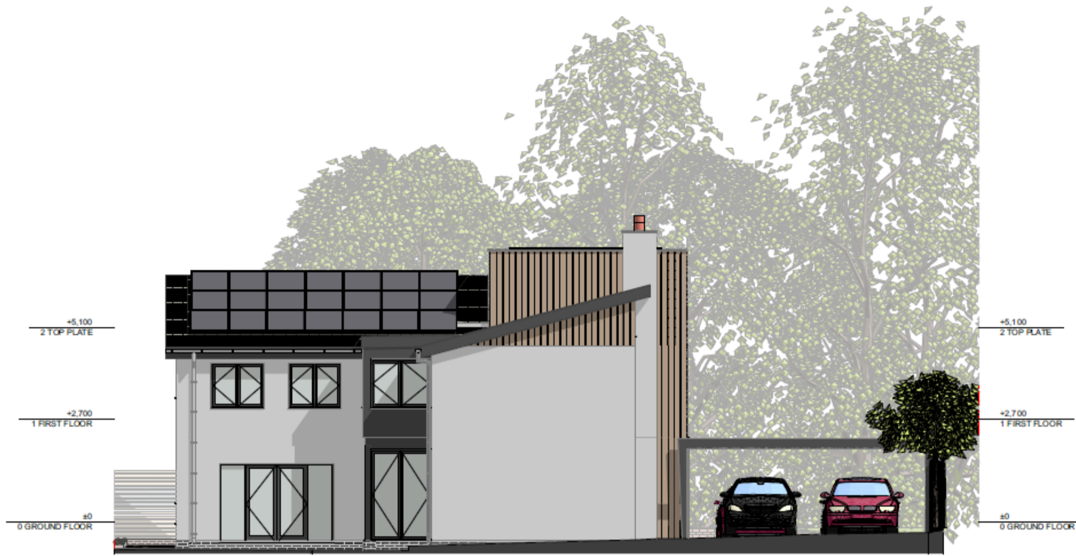
Plot 2 SOUTH ELEVATION 1:100