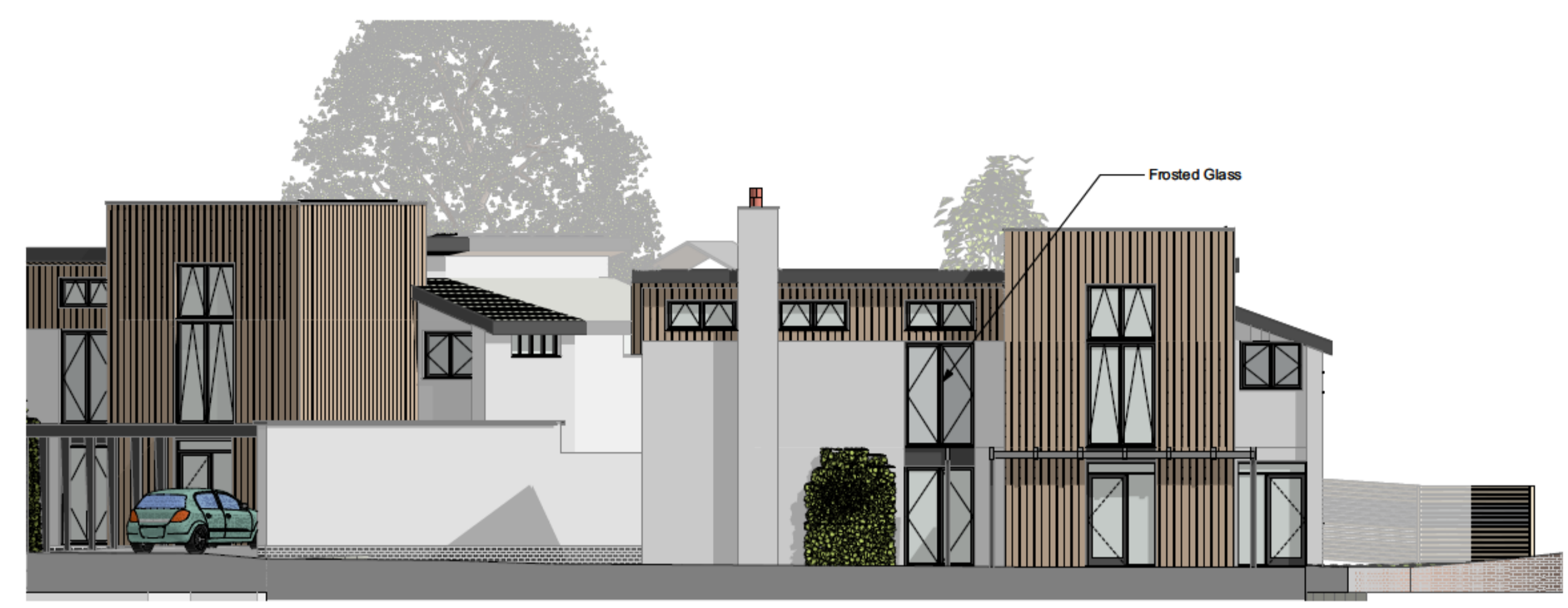
Plot 2 EAST ELEVATION 1:100