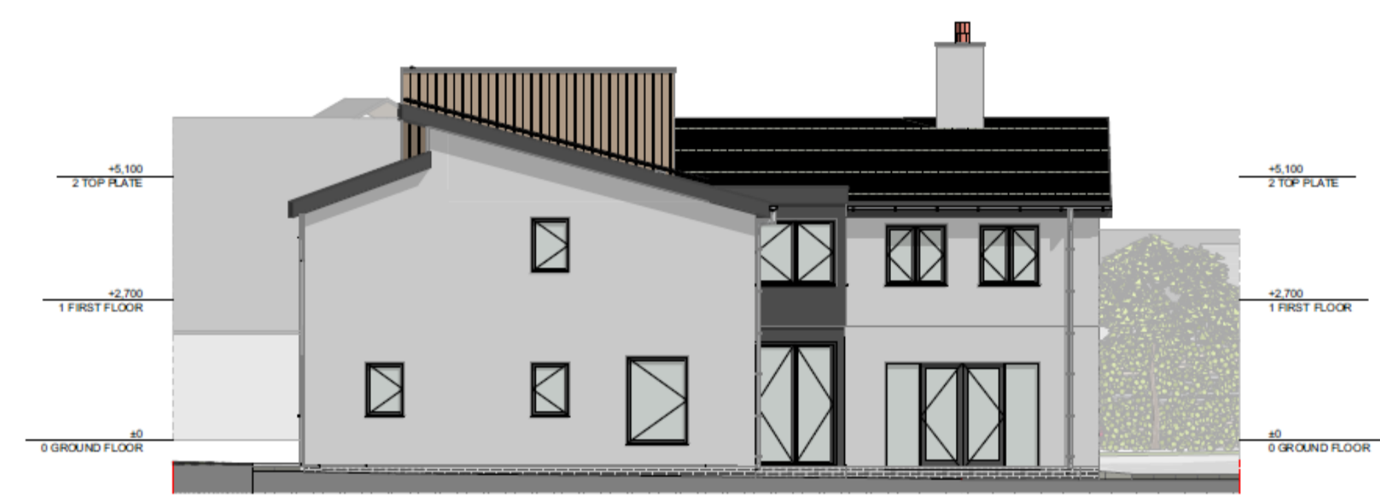
Plot 2 WEST ELEVATION 1:100