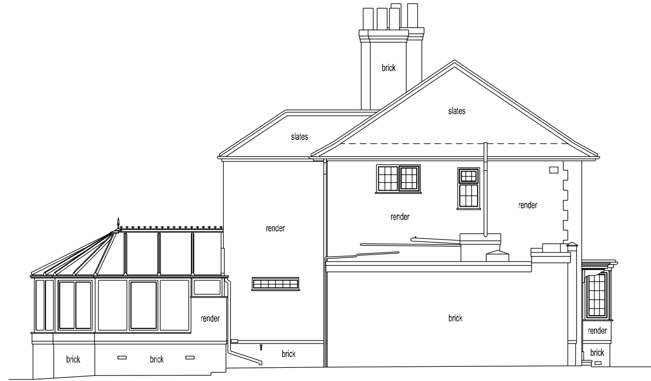
SIDE ELEVATION South