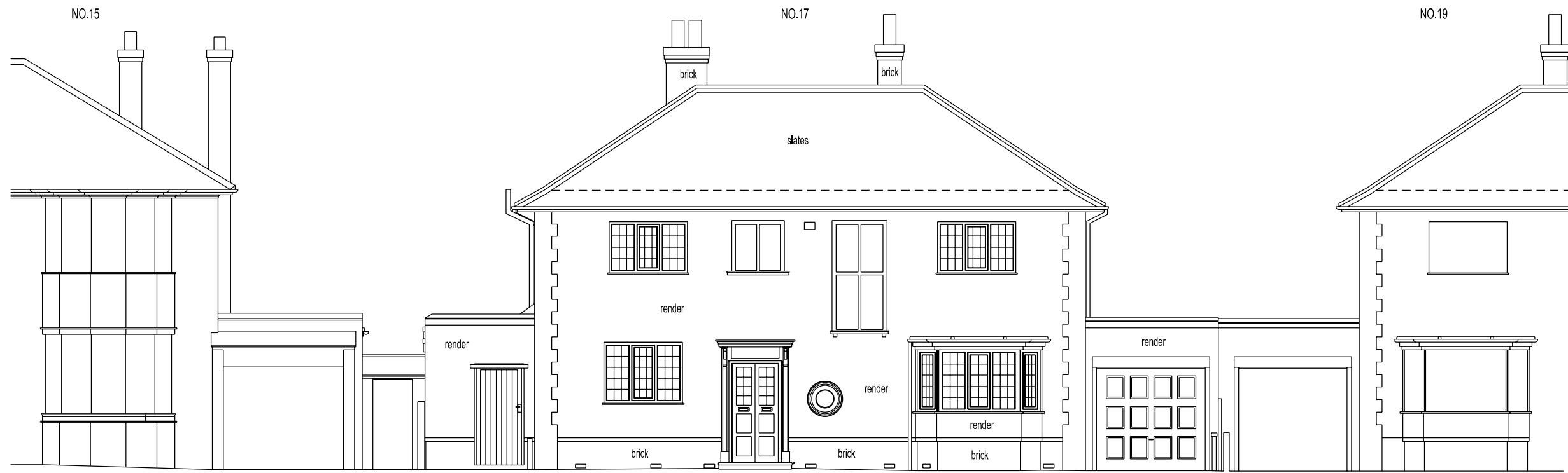
FRONT ELEVATION East