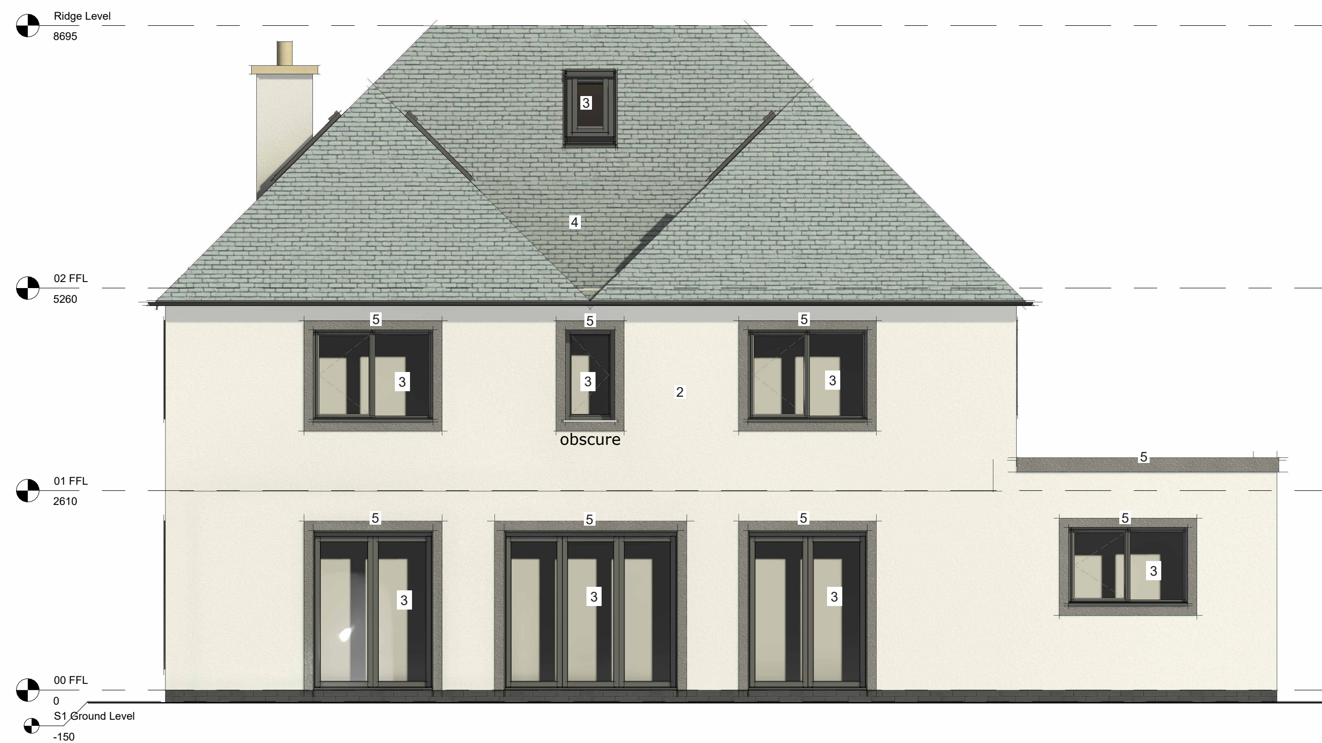
Rear Elevation 1 : 50