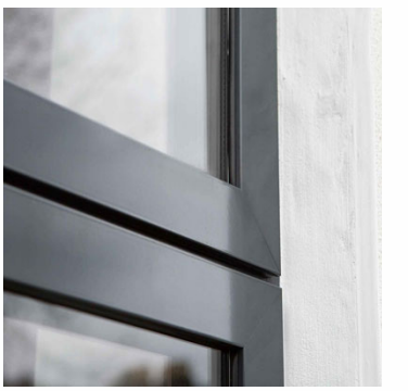
3. Black Alluminium Windows and Doors