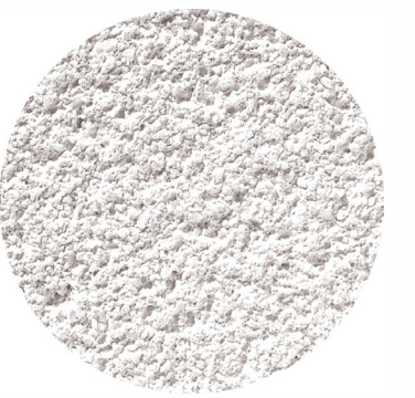
2. Johnstone's Connie White Full Silicone Render 1.5mm