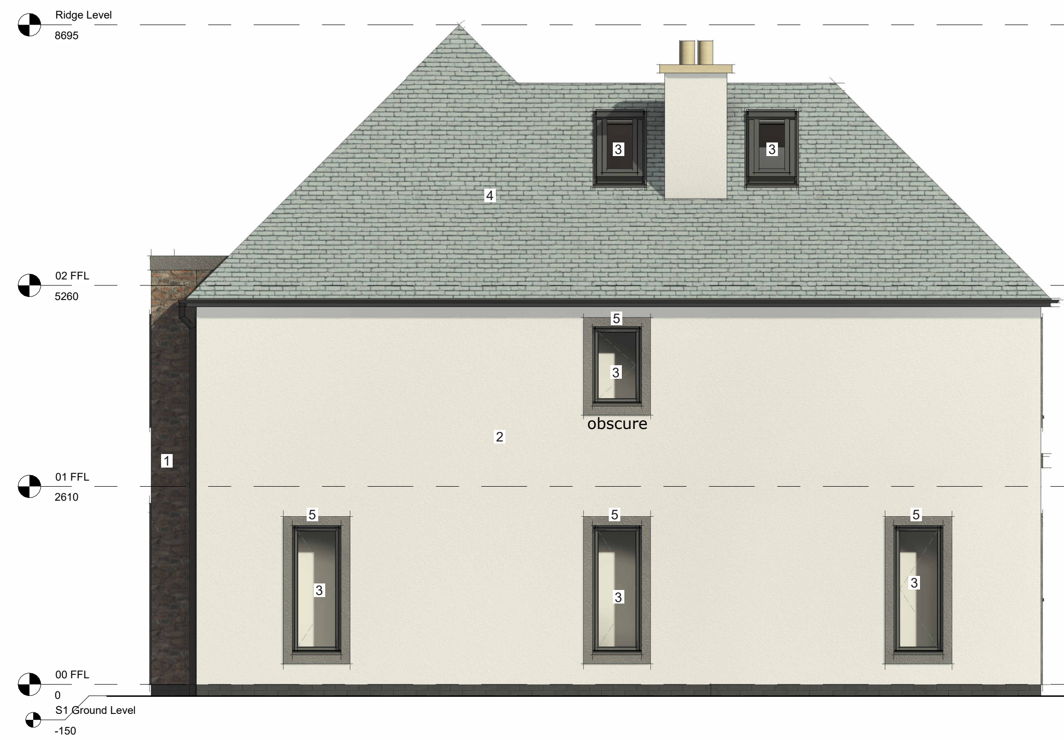
Right Side Elevation 1 : 50