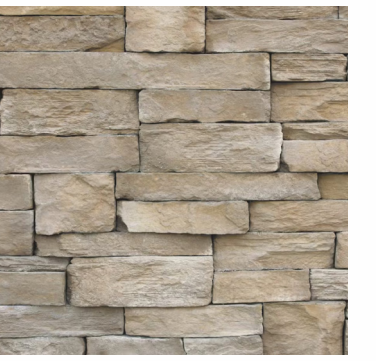
1. Wild Stone Champagne Stone Cladding