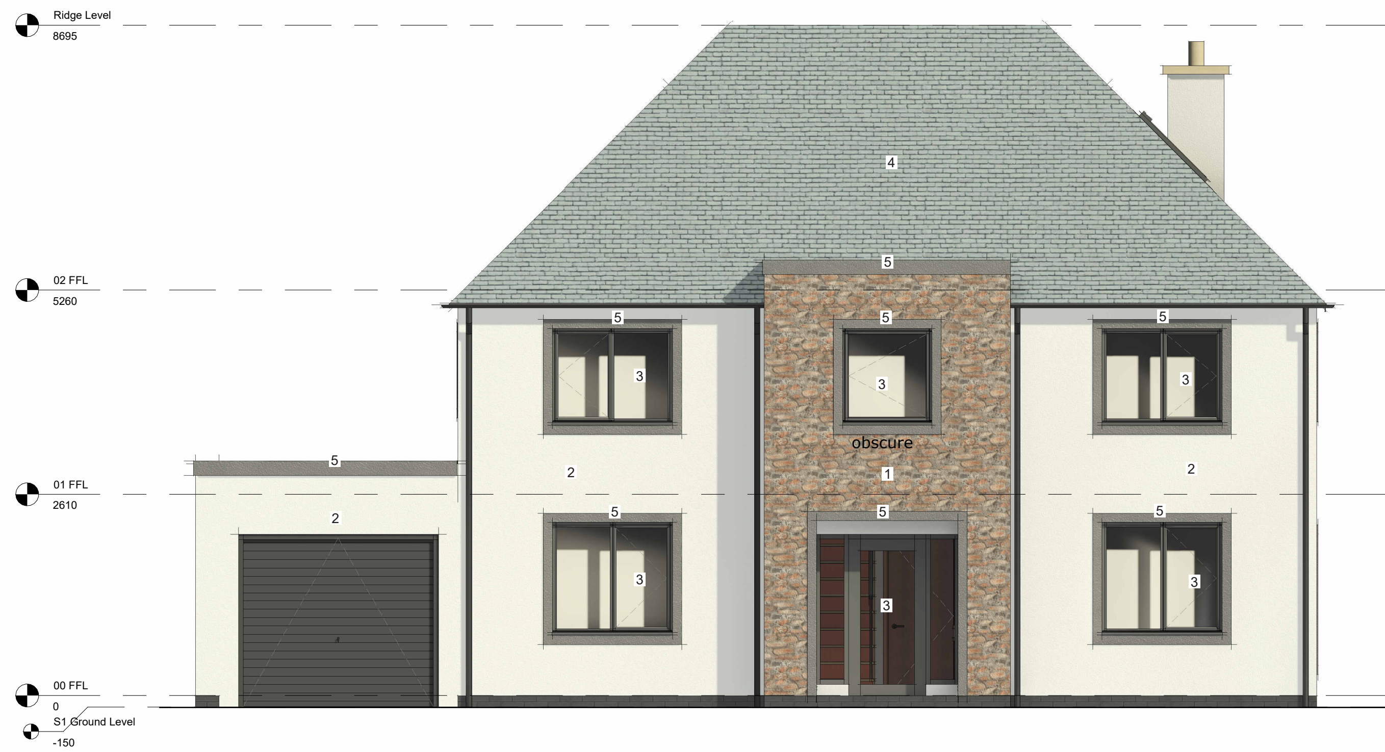
Front Elevation 1 : 50