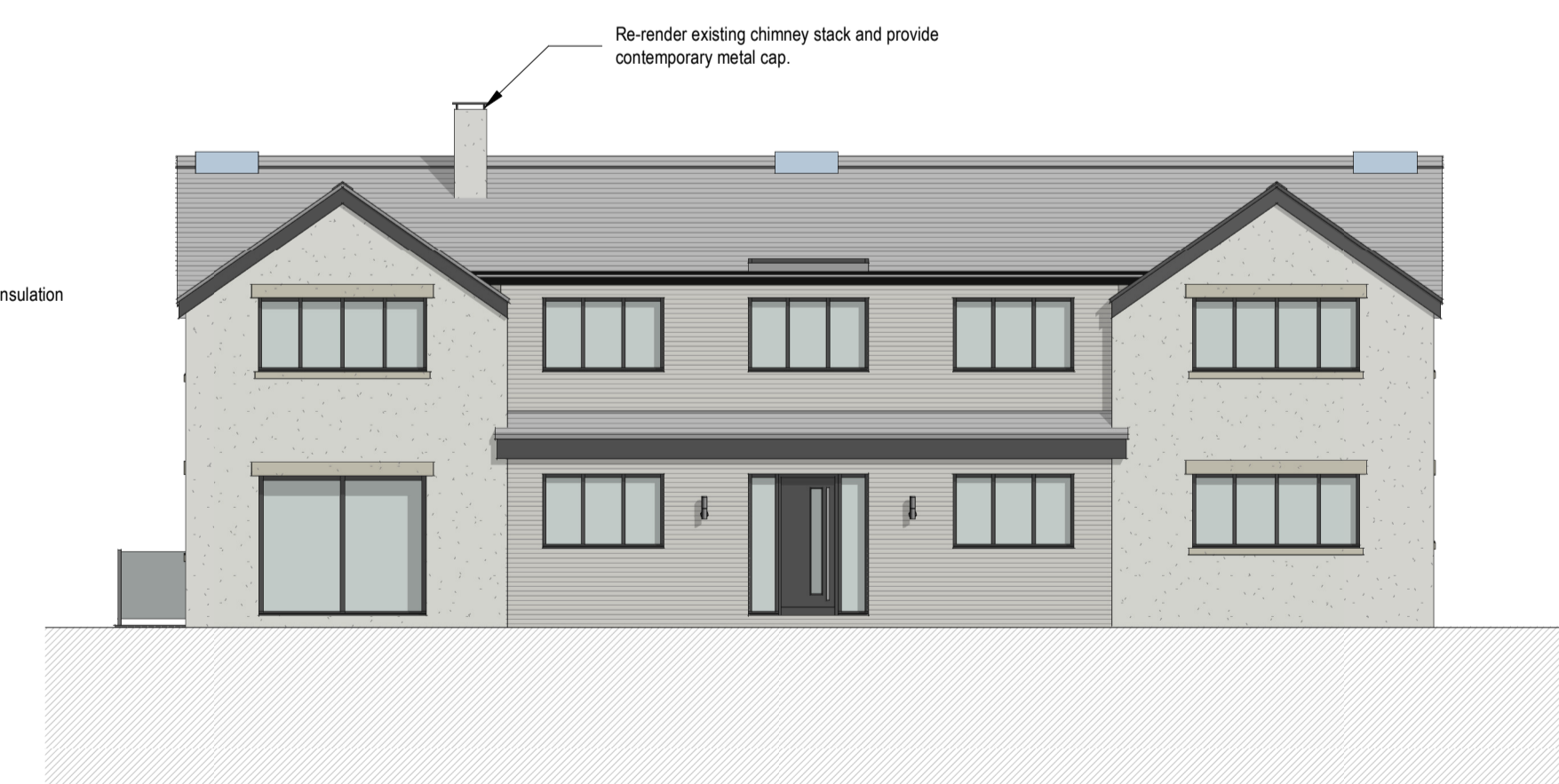
Front Elevation (South)

Smart lighting controlled with a motion sensor to ensure the lights only come on briefly when needed and cannot be left on for extended periods or overnight. All lighting should be low-level and directed down with the use of shields / hoods / cowls to prevent light spillage. Lights positioned 1.5m above ground level. LED lighting with directed beam (low leakage), luminaires at a low height, and with warm light LEDs (no UV), Lamp wattage to be 150w (2000 lumens) and below 2700Kelvin.