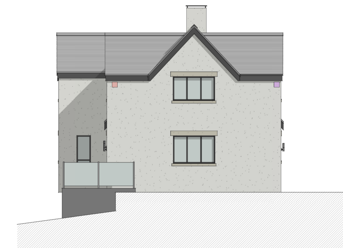
Side Elevation (West)