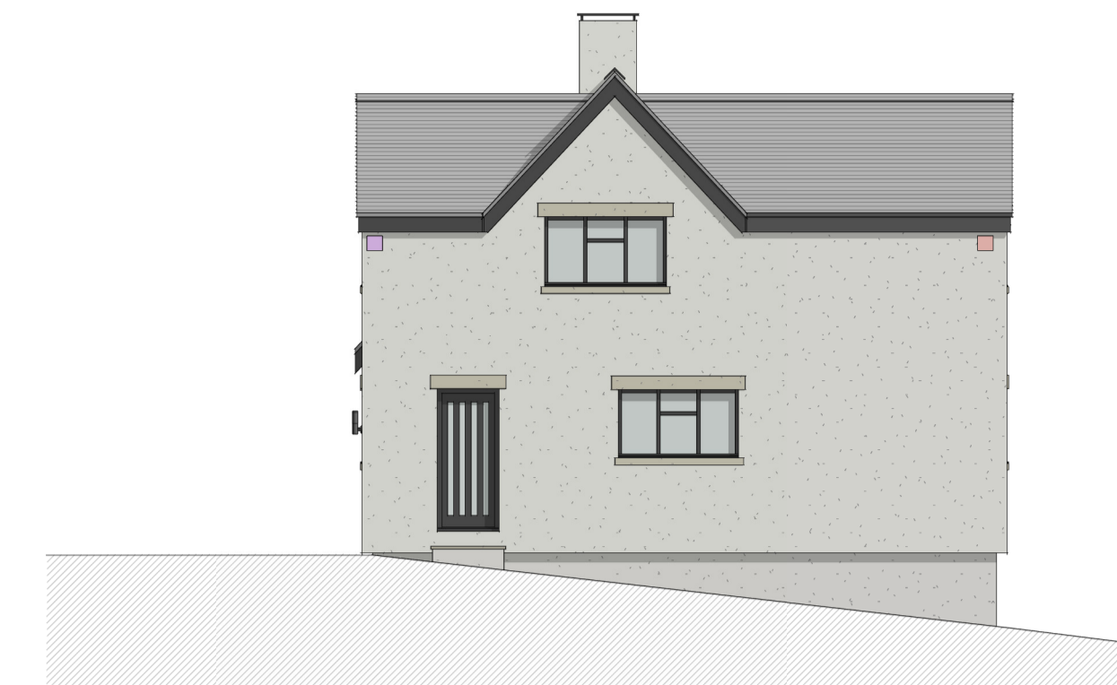
Side Elevation (East)