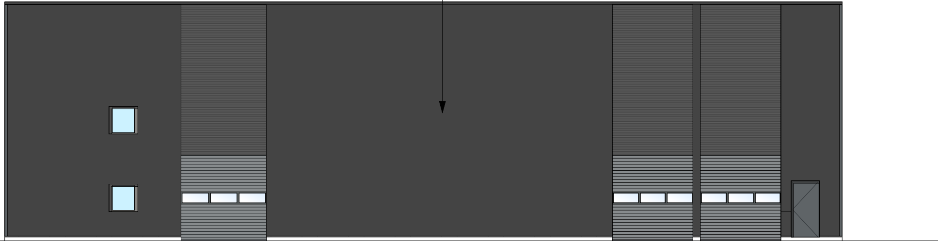
PROPOSED ELEVATION 3

Existing single skin cladding to be finished (coated) to match RAL 7016 anthracite