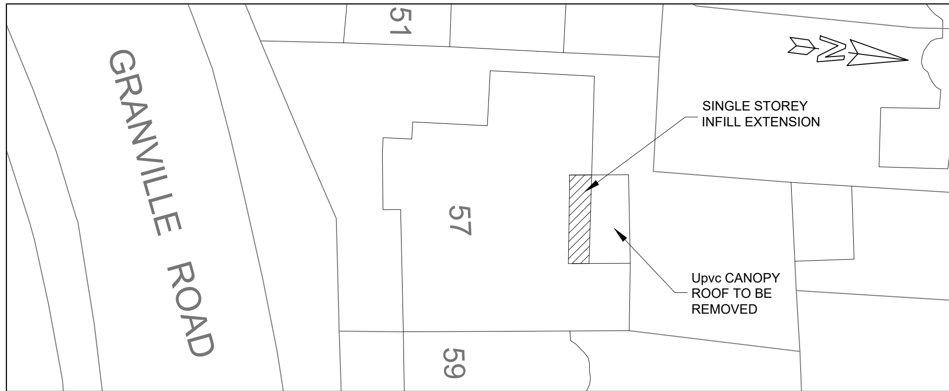
BLOCK PLAN 1:200